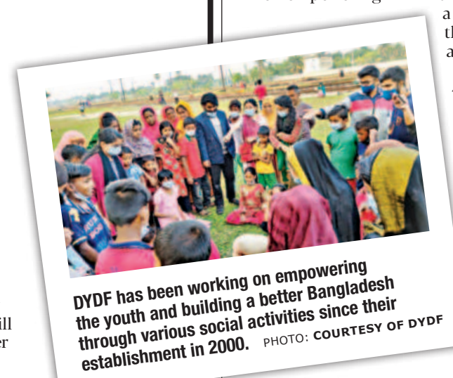
DYDF has been working on empowering the youth and building a better Bangladesh through various social activities since their establishment in 2000.

"Since we started out, we have been working on empowering the youth and building a better Bangladesh through various social activities."