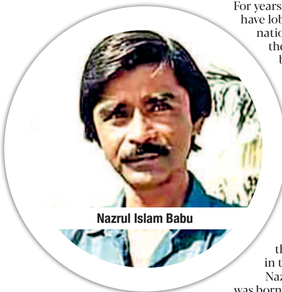
Nazrul Islam Babu

On September 14, 1990, the artiste left us for good. Nazrul Islam Babu was honoured with the National Film Award posthumously, as the best lyricist for the songs in the film "Padma Meghna Jamuna". The film, directed by Chashi Nazrul Islam, was released in 1991.