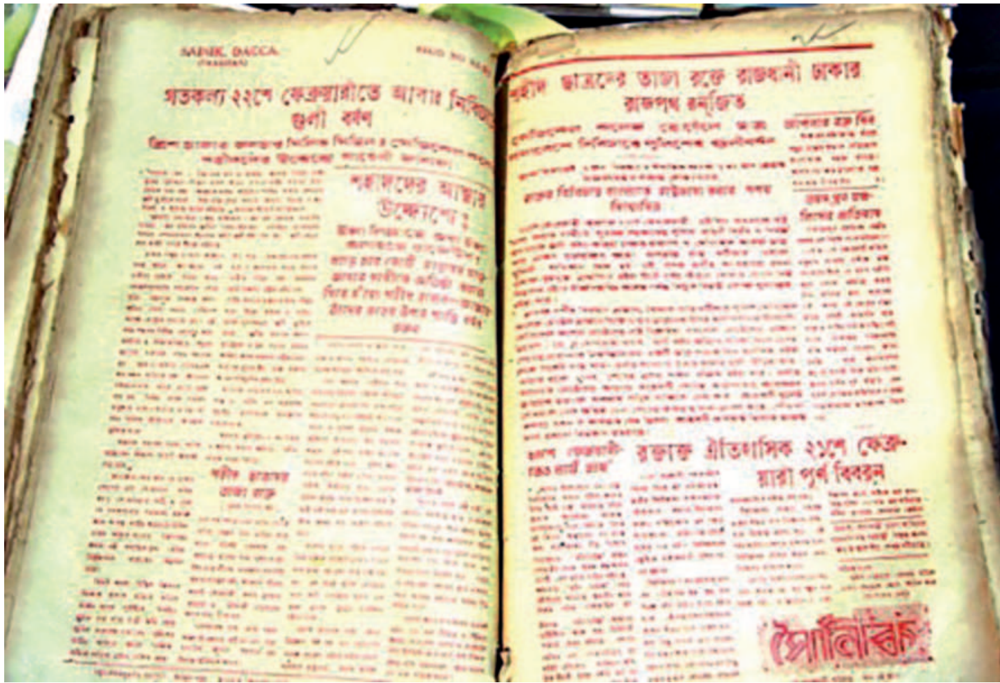
Weekly Sainik, 23 February, 1952.