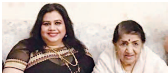
Runa Laila with Lata Mangeshkar.