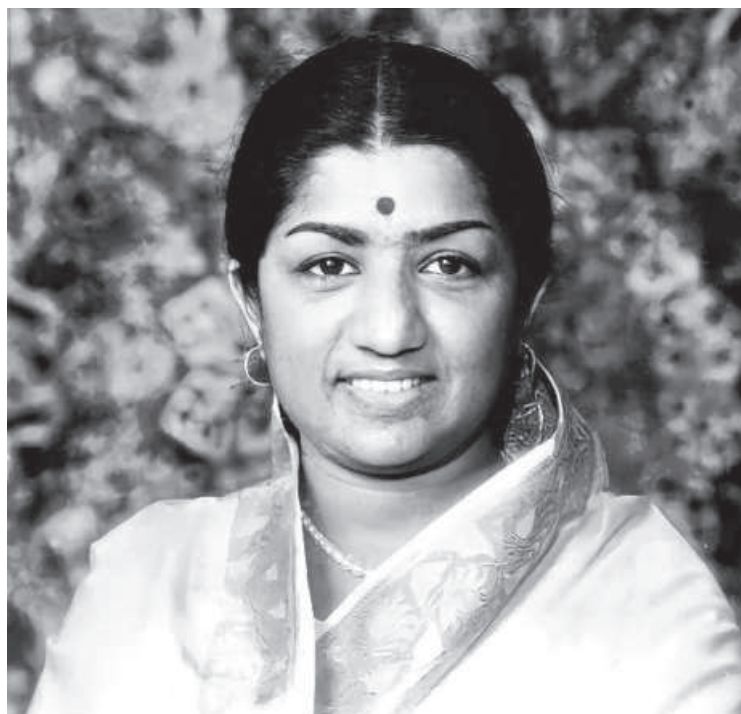
Lata Mangeshkar was the face of Indian music for over 7 decades.

Lata Mangeshkar's rendition of "Aye Mere Watan Ke Logon, Zara Aankh Me Bhar Lo Pani" moved India's first Prime Minister Jawaharlal Nehru to tears, in 1962.