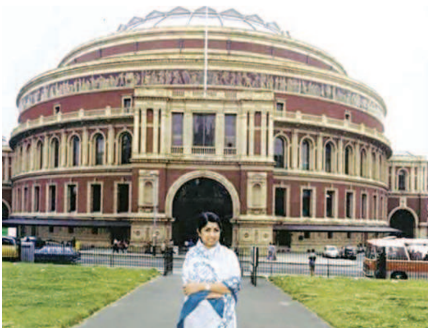
Lata Mangeshkar was the first Indian artiste to perform at the Royal Albert Hall, London.

a special perfume was created in 1999, which was called the "Lata Eau de Parfum". It has a mixture of 78 different essences, with hints of a floral scent.