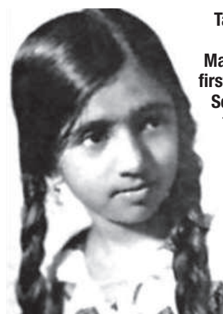
Taken on the day of Lata Mangeshkar's first recording: September 9, 1938.

She did not have to look back after that, as she went on to become the top name in the music industries of not just Bollywood, but lent her god-gifted voice to regional films as well. She also directed the music for 5 films.