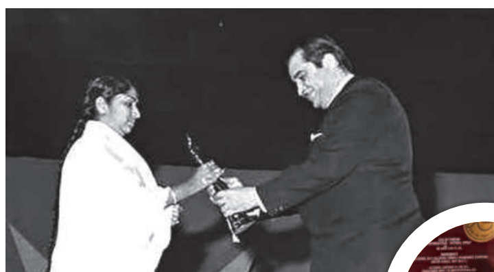
Lata Mangeshkar with Raj Kapoor

recorded artiste. Currently, Pulapaka Susheela holds the record.