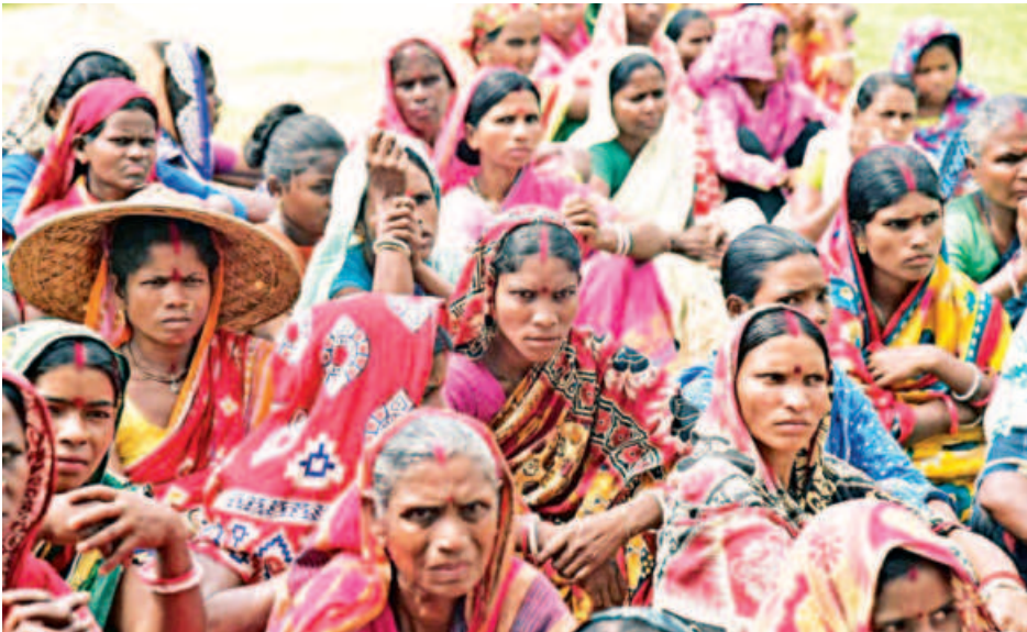
As the government starts listing the beneficiaries of its special scheme for tea workers around the country, temporary workers of the tea gardens remain excluded from its benefits. With the sense of uncertainty looming over their heads, they have only one question: What does the future hold?