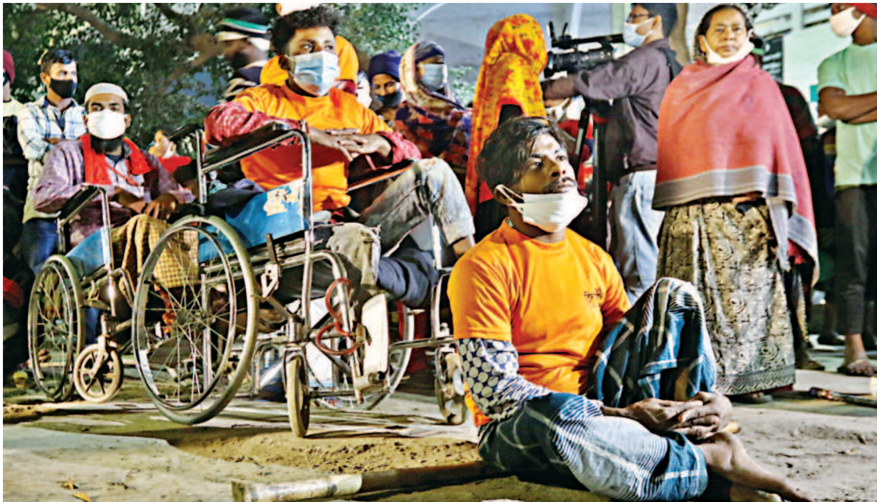
Homeless people, many of them with disabilities, in a queue to get inoculated against coronavirus in the capital's Kamalapur yesterday evening. The government's Expanded Programme on Immunisation vaccinated over 200 individuals during the drive.