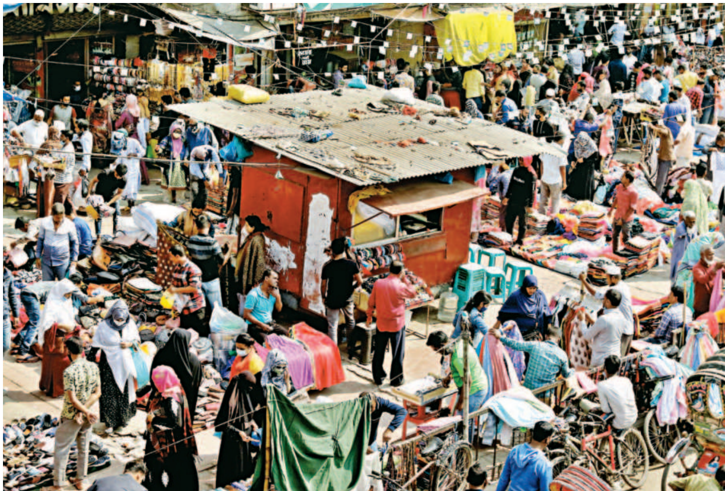
An eatery in the middle of the pavement near New Market in the capital. There are major shopping malls in the area and pedestrians as well as motorists suffer on the road because of such encroachment by hawkers.