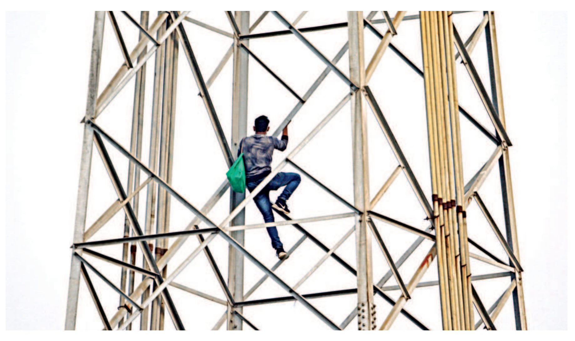
At the port city's Zohur Ahmed Chowdhury Stadium, work was underway to fix its flood lights recently. However, the workers could be seen climbing these tall structures without head gear, harness or any other kind of protective equipment, putting them under heavy risk of accidents.