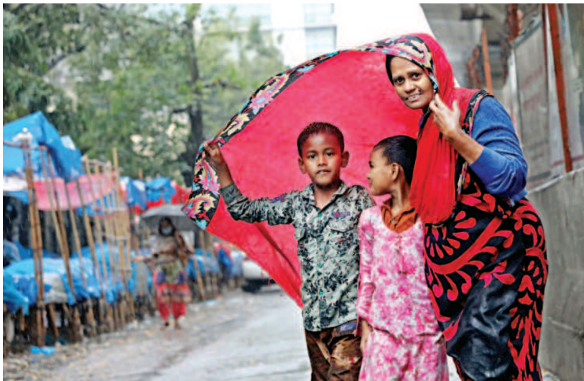
A woman tries to shield two children from rain with her saree while crossing a road near the Baitul Mukarram National Mosque yesterday. The wintry rain on the weekend brought chill and trouble for the city dwellers, particularly those from the low-income families.