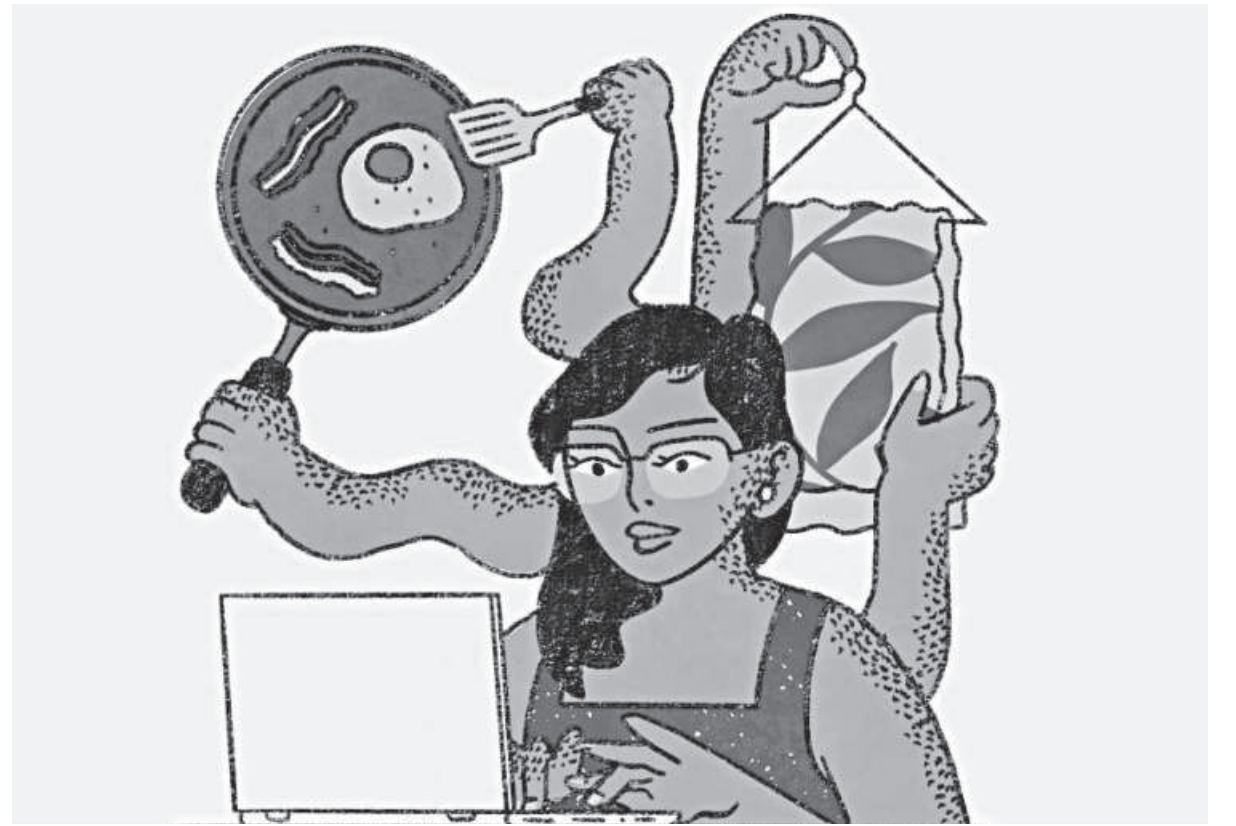
▲ STOCK ILLUSTRATION

Then there is this notion that has become default: "Men just aren't as good at doing stuff around the house." While there is no logical explanation behind why men would not be able to perform household tasks "as well as women do," this