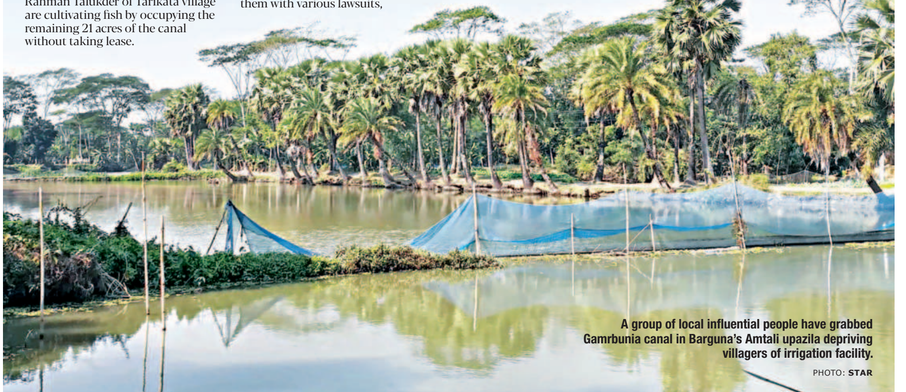
A group of local influential people have grabbed Gamrbania canal in Barguna's Amtali upazila depriving villagers of irrigation facility.