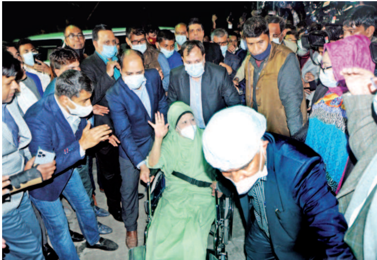
BNP Chairperson Khaleda Zia waves to party leaders while coming out of Evercare Hospital in the capital last night. She returned to her Gulshan home after receiving treatment at the hospital for 80 days.

Both the number of infection and the positivity rate have skyrocketed, but the number of hospital admission has remained low compared to previous waves.