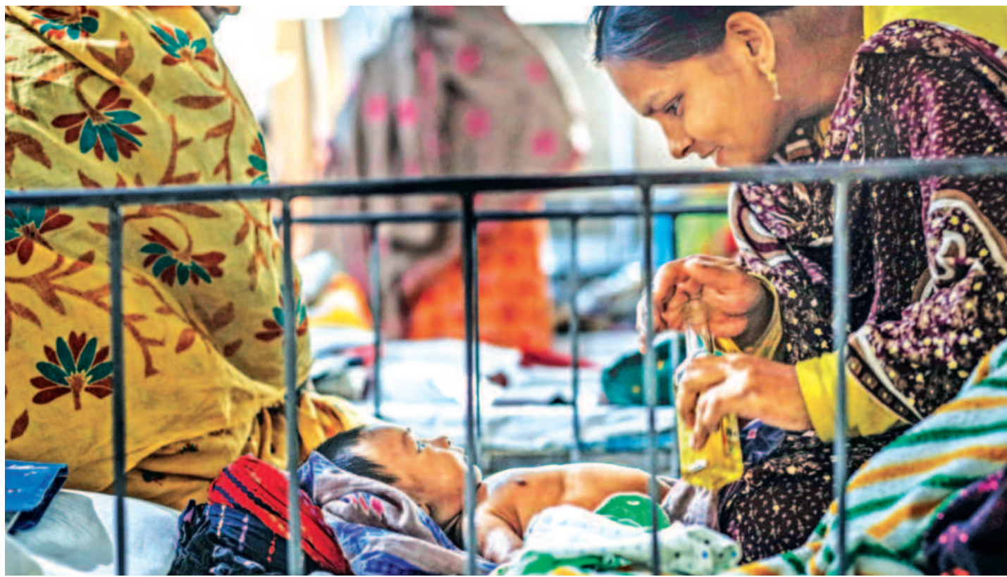
At Dhaka Shishu Hospital, this little one from Mirpur was seen enjoying an oil massage from his mother. But the reality behind the picture is not that pleasant, as the infant was diagnosed with pneumonia about a week ago. As the clasp of winter ceases to relent, the hospital is seeing an increase in the number of patients coming in with pneumonia and other cold-related issues. The photo was taken yesterday.

The court also ordered the government's concerned authorities to submit a report on the progress of establishing permanent and temporary chemical sites in Munshiganj, Shyampur, and Tongi by the same deadline in response to a writ petition. Bangladesh Environmental Lawyers Association filed the petition with the HC.