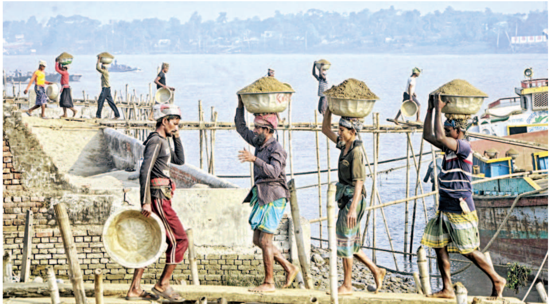
Load-workers from all over Khulna city gather at Rupsha Ghat in search of work every day. One of their more regular jobs is unloading sand from cargo ships, walking delicately through narrow, makeshift bridges. Each basket of load gets them Tk 3.5, with the average worker unloading 120-150 baskets a day. This photo was taken yesterday.

Forty-seven mysterious deaths of women and girls were reported, of whom, six were children. Four incidents of child marriage also took place.