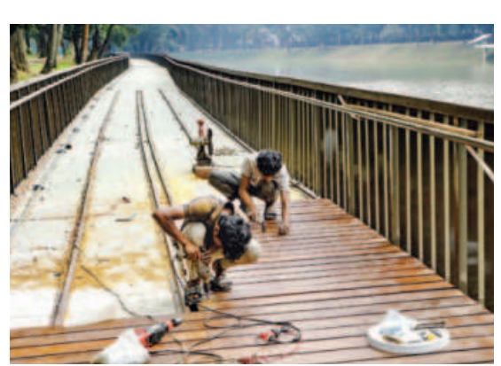
The Public Works Department constructing a walkway bordering the lake inside Ramna Park in the capital. The authorities have taken the step as a part of its beautification work across the recreation site situated right at the heart of Dhaka. The photo was taken yesterday.