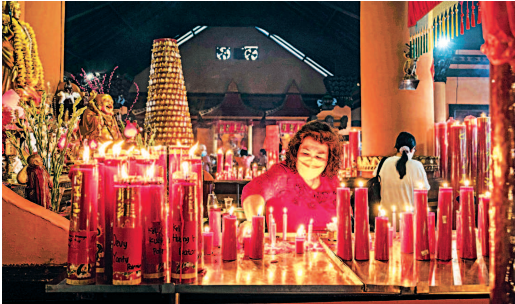
People pray to mark the start of the Lunar New Year of the Tiger at a temple in Surabaya, Indonesia, yesterday.