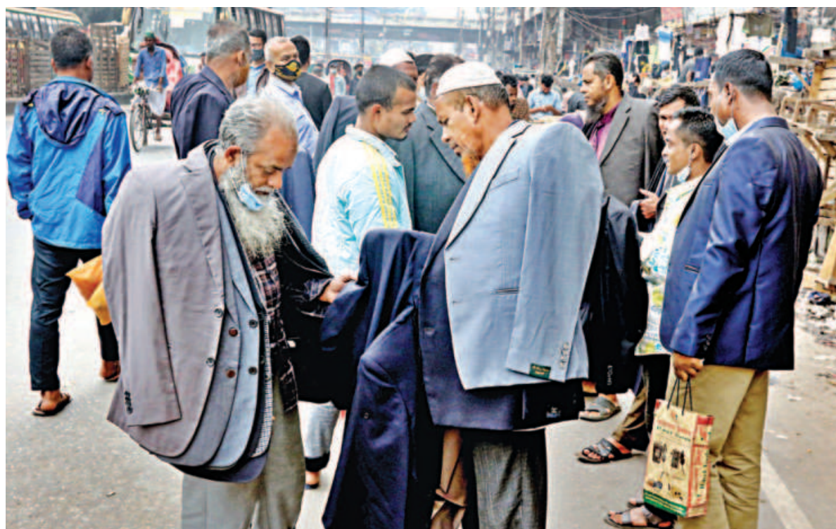
Hawkers sell used jackets to a large number of underprivileged people, who cannot afford clothes to keep them warm in the shivering winter, living in the capital. Each jacket costs between Tk 100 and Tk 300. The photo was taken in the capital's Gulistan area yesterday.