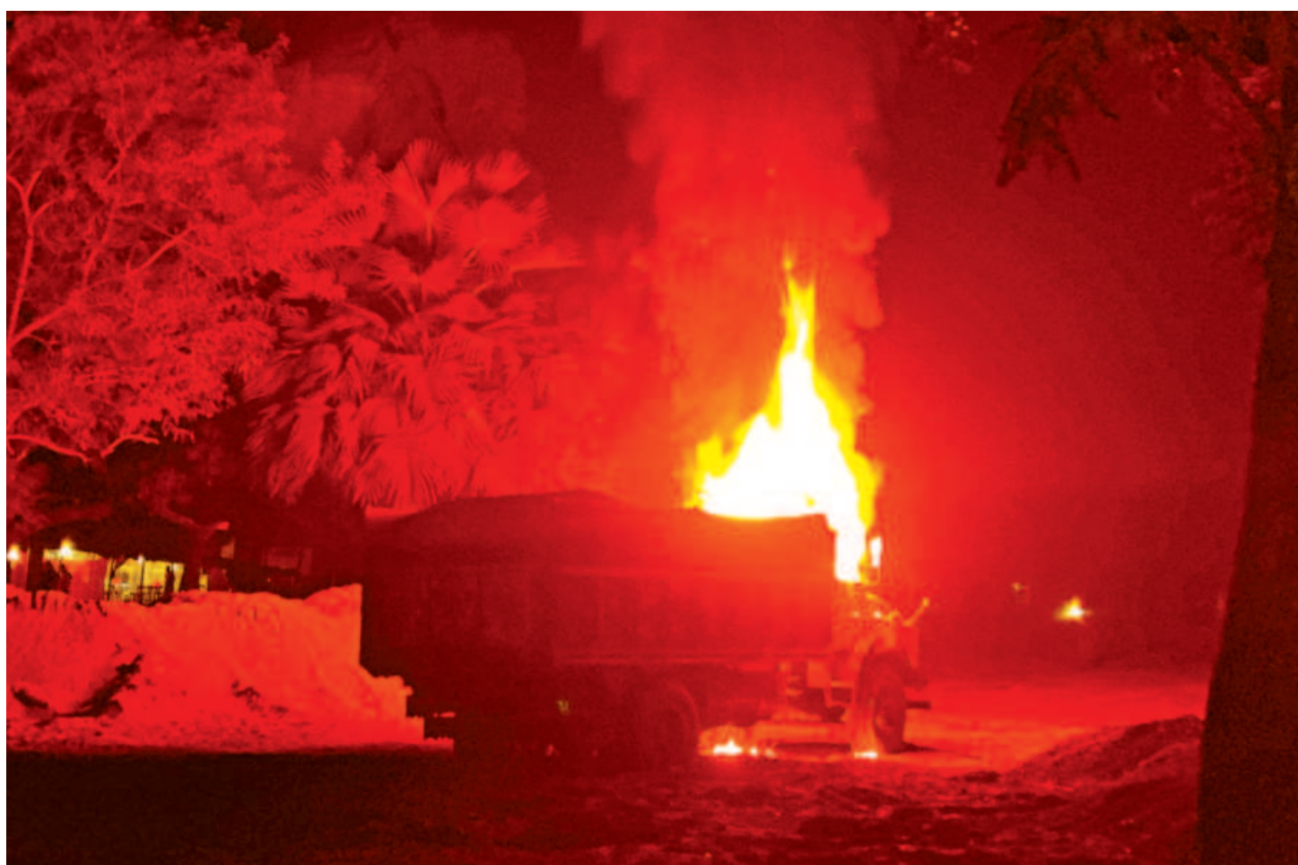
A truck in flames on Rajshahi University campus last night after students set it ablaze protesting the death of a fellow student under the wheels of a truck only a few yards away. The demonstrating students also blocked the Dhaka-Rajshahi highway in Kajla Gate area.