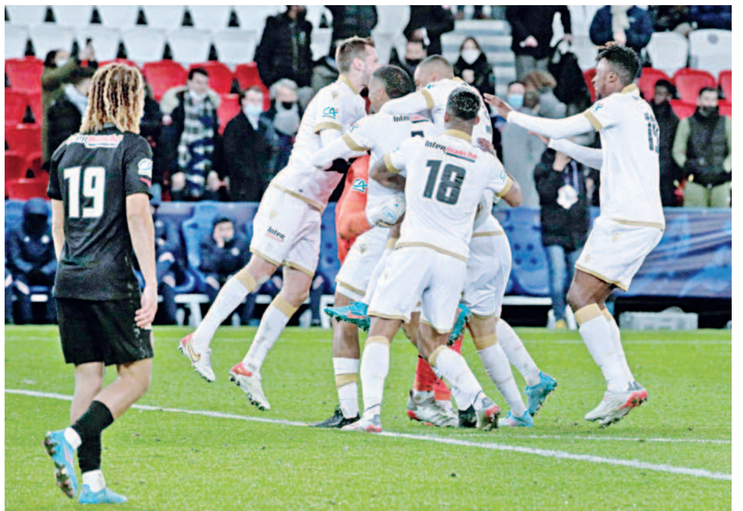
Paris Saint-Germain midfielder Xavi Simons (L) passes by as Nice players celebrate winning the penalty shootout against Paris Saint-Germain in French Cup Last 16 at the Parc des Princes in Paris on Monday. Goalkeeper Marcin Bulka, on loan from PSG, emerged with two saves in the shootout as Nice edged the tiebreaker 6-5 following a goalless draw in regulation time.

Premier League leaders Manchester City have signed forward Julian Alvarez for a reported £14 million, but the Argentine will remain with River Plate on loan until at least July. The 22-year-old has scored 36 goals in 96 games for River and has five Argentina caps to his name.