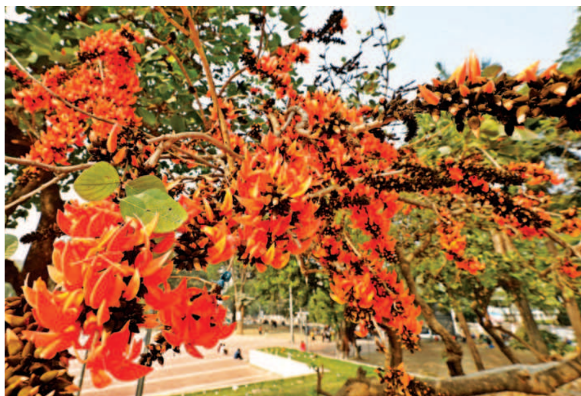
A palash ( Butea monosperma ) tree blossoms near the Central Shaheed Minar in the capital, heralding spring. Pahela Falgun, the first day of the season, according to the Bangla calendar, falls on February 14. The photo was taken yesterday.

Nadal also became only the fourth man to win each of the four Grand Slams twice and the third oldest man in the Open Era to win a Grand Slam title, behind Ken Rosewall and Federer.