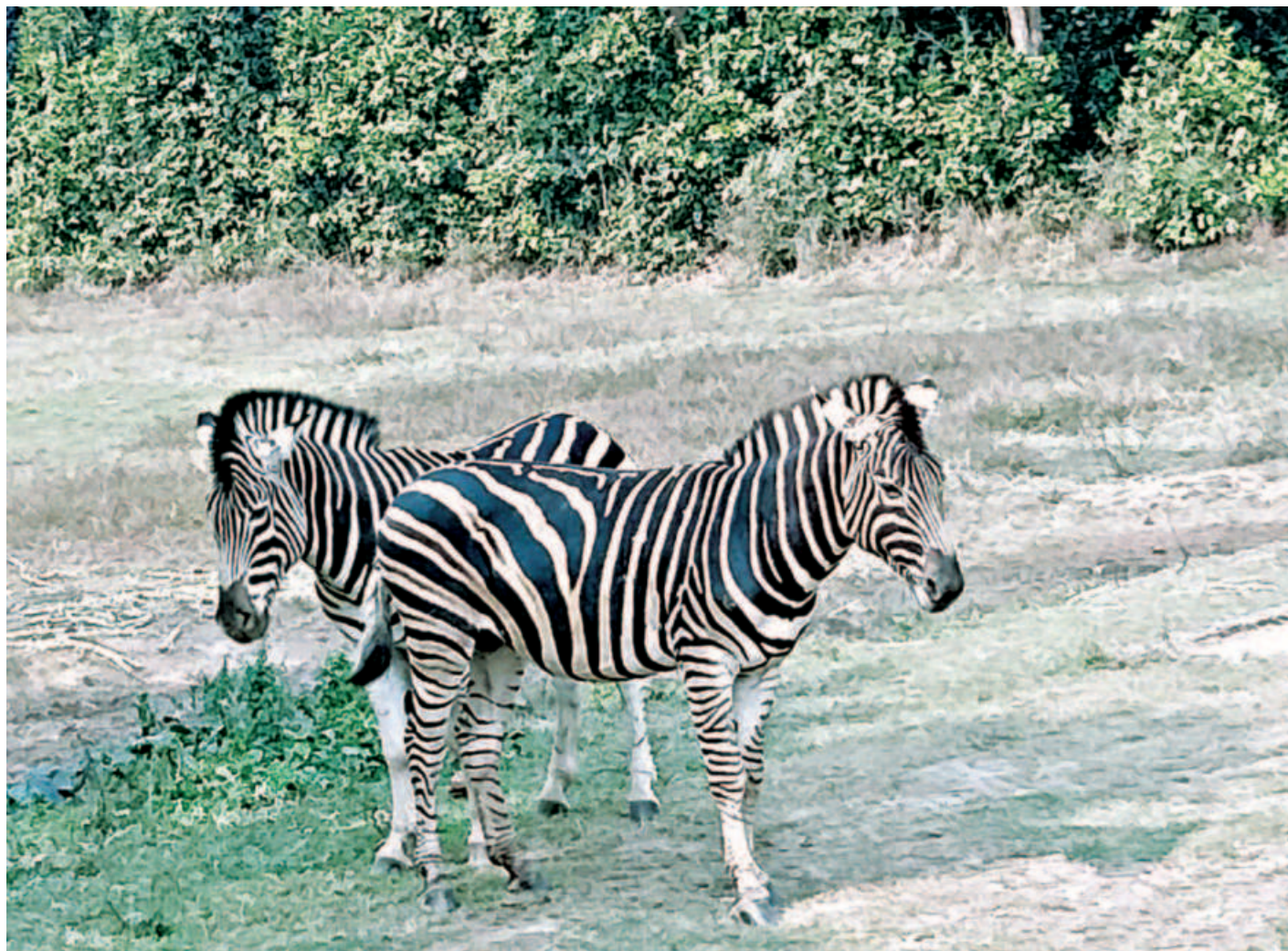
Two zebras in the Bangabandhu Sheikh Mujib Safari Park in Gazipur. Eleven out of 31 died this month. According to the authorities, seven died from diseases and the rest after fighting with each other. There were 70 animals, including the zebras, in the park's African Safari section. This photo was captured yesterday.

"Since we haven't got the lab report in hand, we didn't disclose the matter," he added.