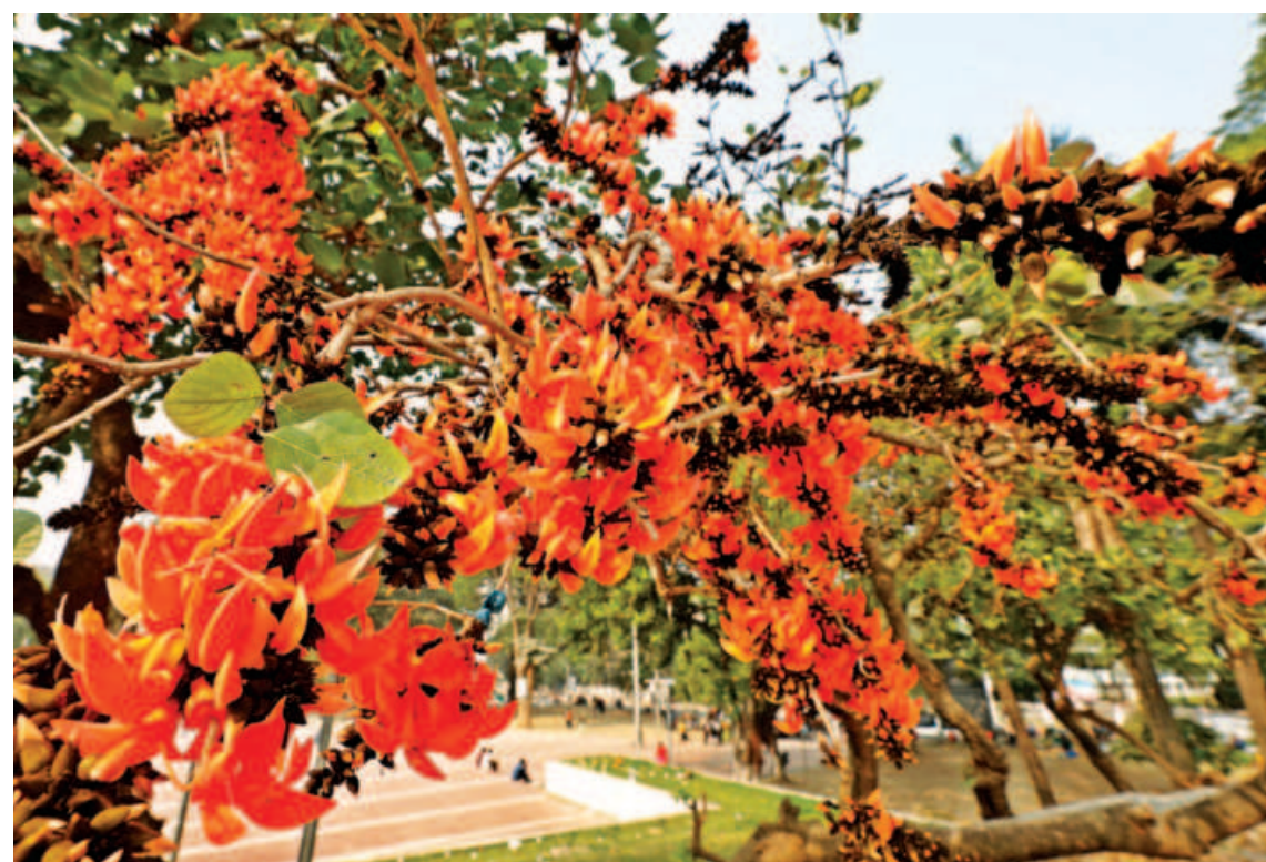
A palash (Butea monosperma) tree blossoms near the Central Shaheed Minar in the capital, heralding spring. Pahela Falgun, the first day of the season, according to the Bangla calendar, falls on February 14. The photo was taken yesterday.

Nadal also became only the fourth man to win each of the four Grand Slams twice and the third oldest man in the Open Era to win a Grand Slam title, behind Ken Rosewall and Federer.