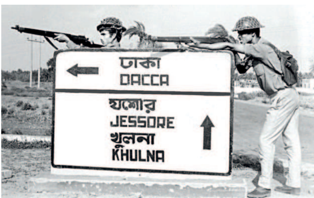
Bangladesh Mukti Foj at Jessore. April 4, 1971