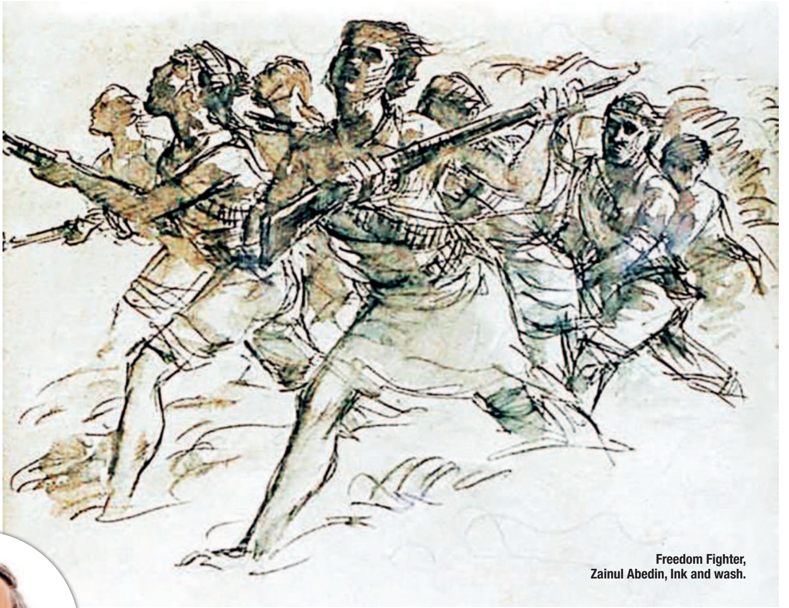
Freedom Fighter, Zainul Abedin, Ink and wash.

I have distributed all my arms to Ansars, mujahids, students