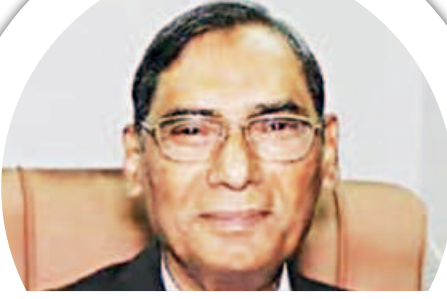
Mahbub Uddin Ahmed Bir Bikram