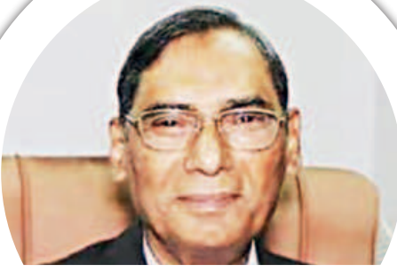
Mahbub Uddin Ahmed Bir Bikram