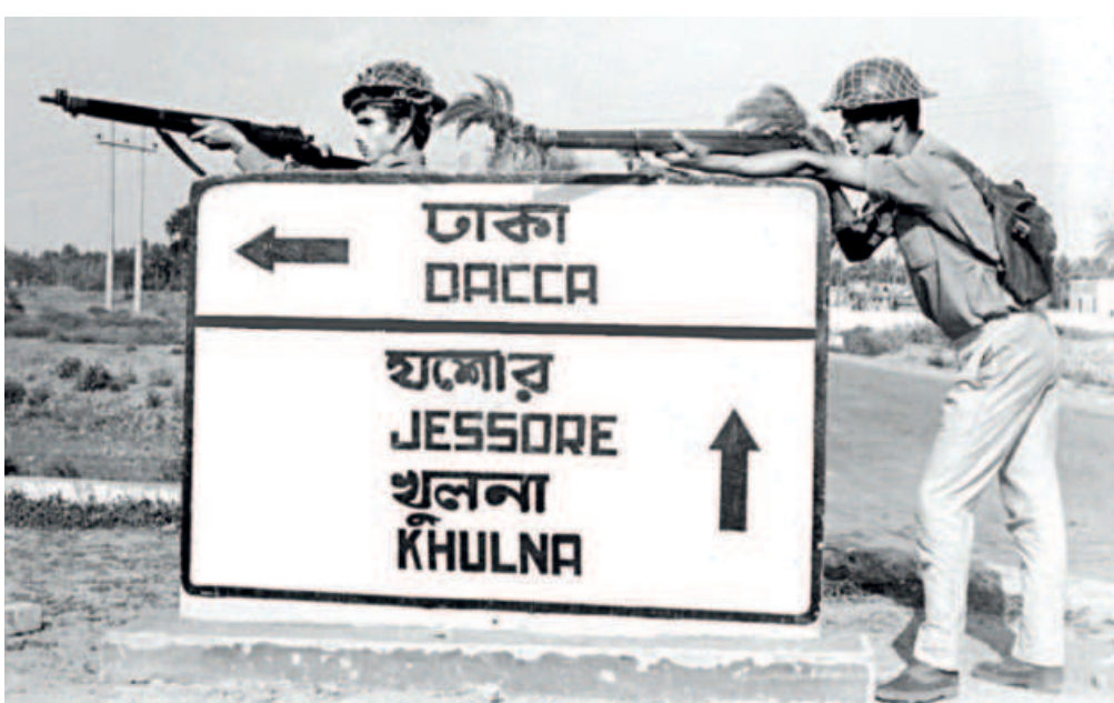
Bangladesh Mukti Foj at Jessore. April 4, 1971