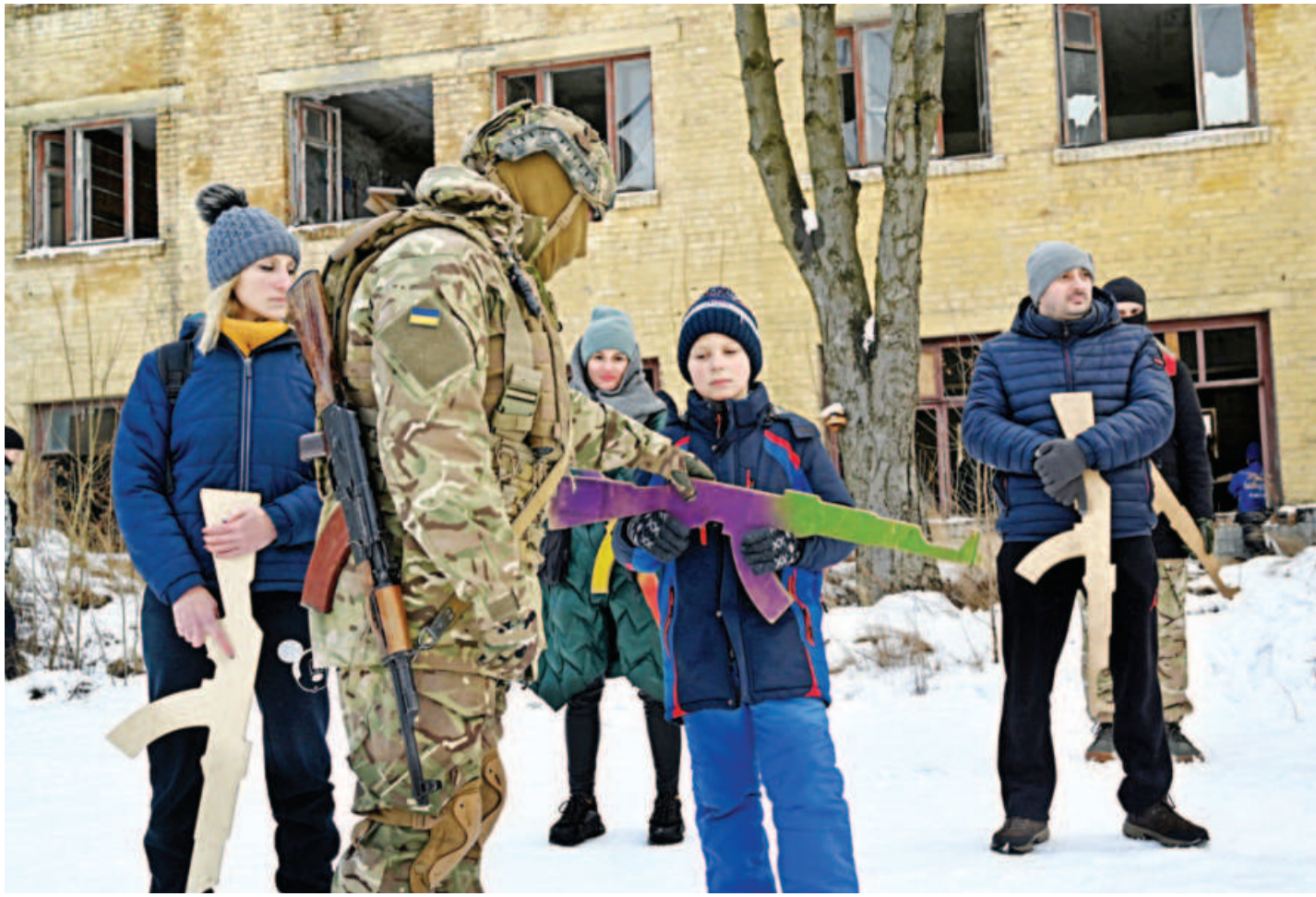
A military instructor teaches civilians holding wooden replicas of Kalashnikov rifles, as they take part in a training session at an abandoned factory in the Ukrainian capital of Kyiv, yesterday. As fears grow of a potential invasion by Russian troops massed on Ukraine's border, within the framework of the training there were classes on tactics, paramedics, training on the obstacle course. The training is conducted by instructors with combat experience, members of the public initiative "Total Resistance".

In January, 21 militants, including 8 Pakistan nationals, have been killed across Indian Kashmir, according to police.