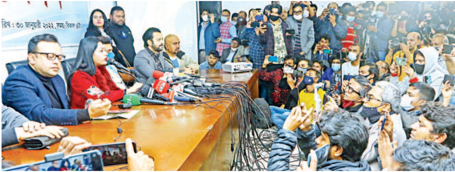
All the members of the Ilias-Nipun panel stood in solidarity with Nipun.