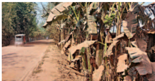
Commuters suffer due to delay in construction of this 8.5km road in Thakurgaon Sadar upazila.