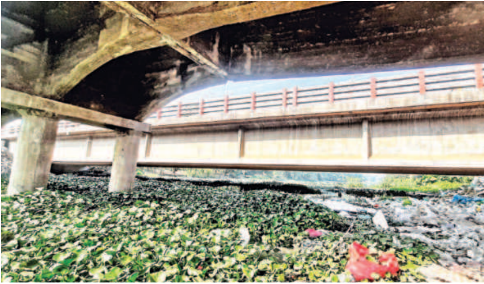
The bridge is built so dangerously low that not even tiny boats can pass through. As a result, it has to be demolished to give way to a new, higher bridge, at a hefty loss of public funds.

He further said in Bangladesh Gazette 2010 and 2018, it is clearly mentioned that before building a bridge over any river, one has to have the consent of BIWTA, though this was not done in this case.