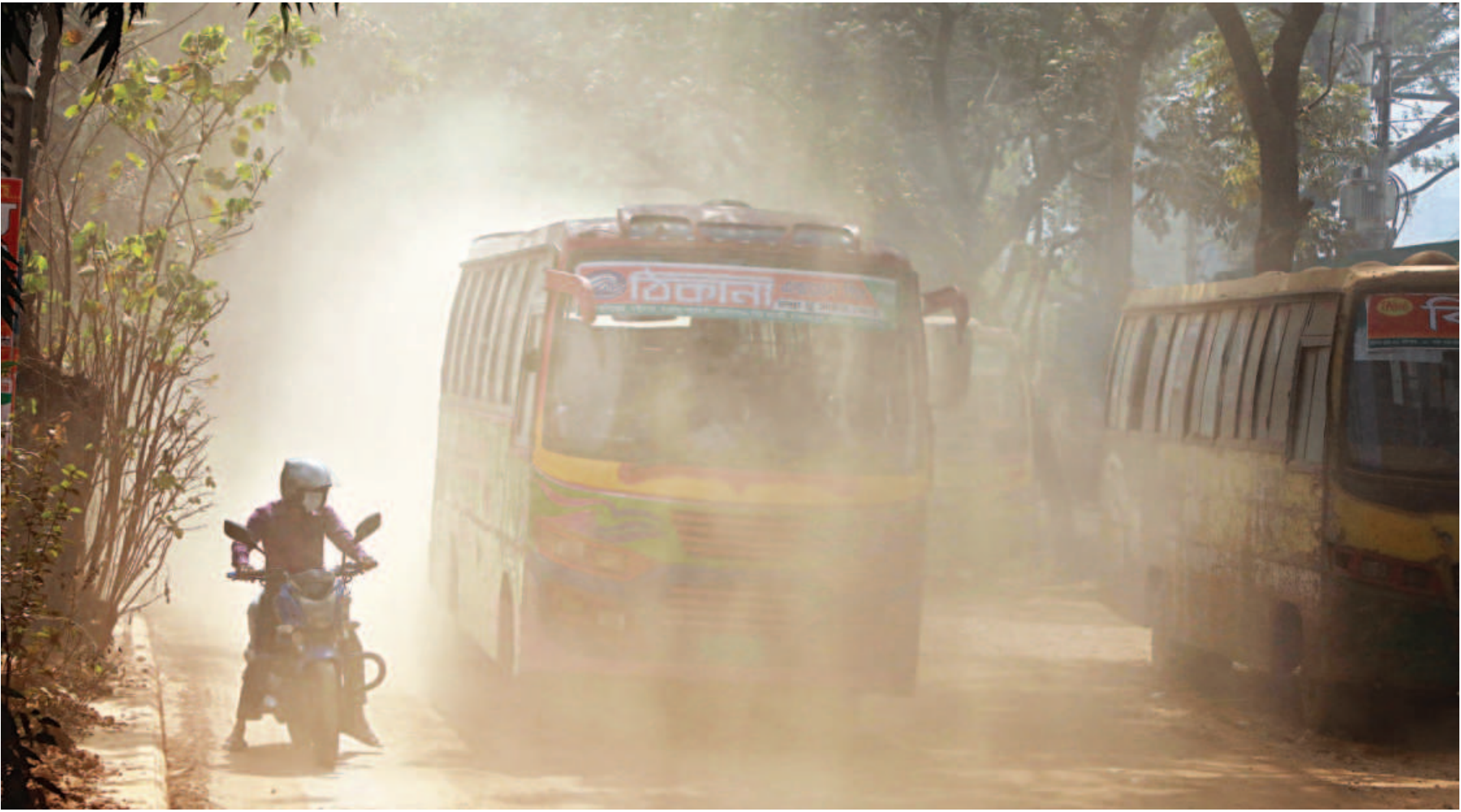
As large vehicles carry rubble from Azimpur colony’s demolition works elsewhere, dust has spread across adjacent roads, to the point that seeing has become difficult. This is in clear violation of the mandate to cover construction materials and vehicles that carry them, which is increasing health risk in the area and the possibility of accidents. This photo was taken in front of Eden College yesterday.

The boat also carried Egyptian nationals.