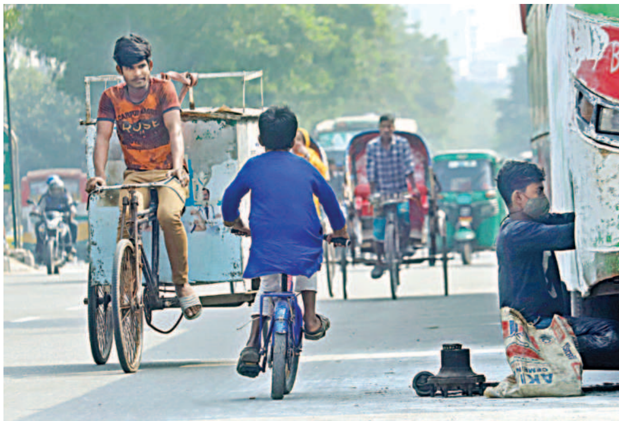
A small boy riding a bicycle against the traffic on a busy road in the capital's Malibagh. Such an activity could lead to an accident. Traffic rules and safe use of roads should be taught more extensively in elementary schools.

A reporter of the newspaper said the authorities yesterday informed them of the decision and assured of paying all dues.