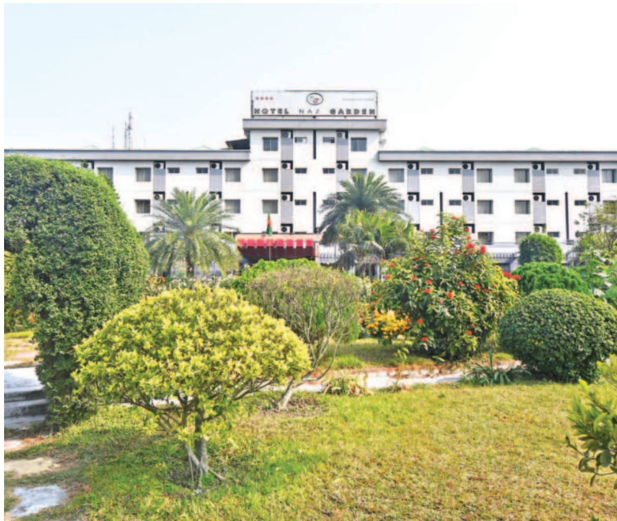
Naz Garden, the first three-star hotel in northern Bangladesh, is incurring losses due to the pandemic, its owner said.