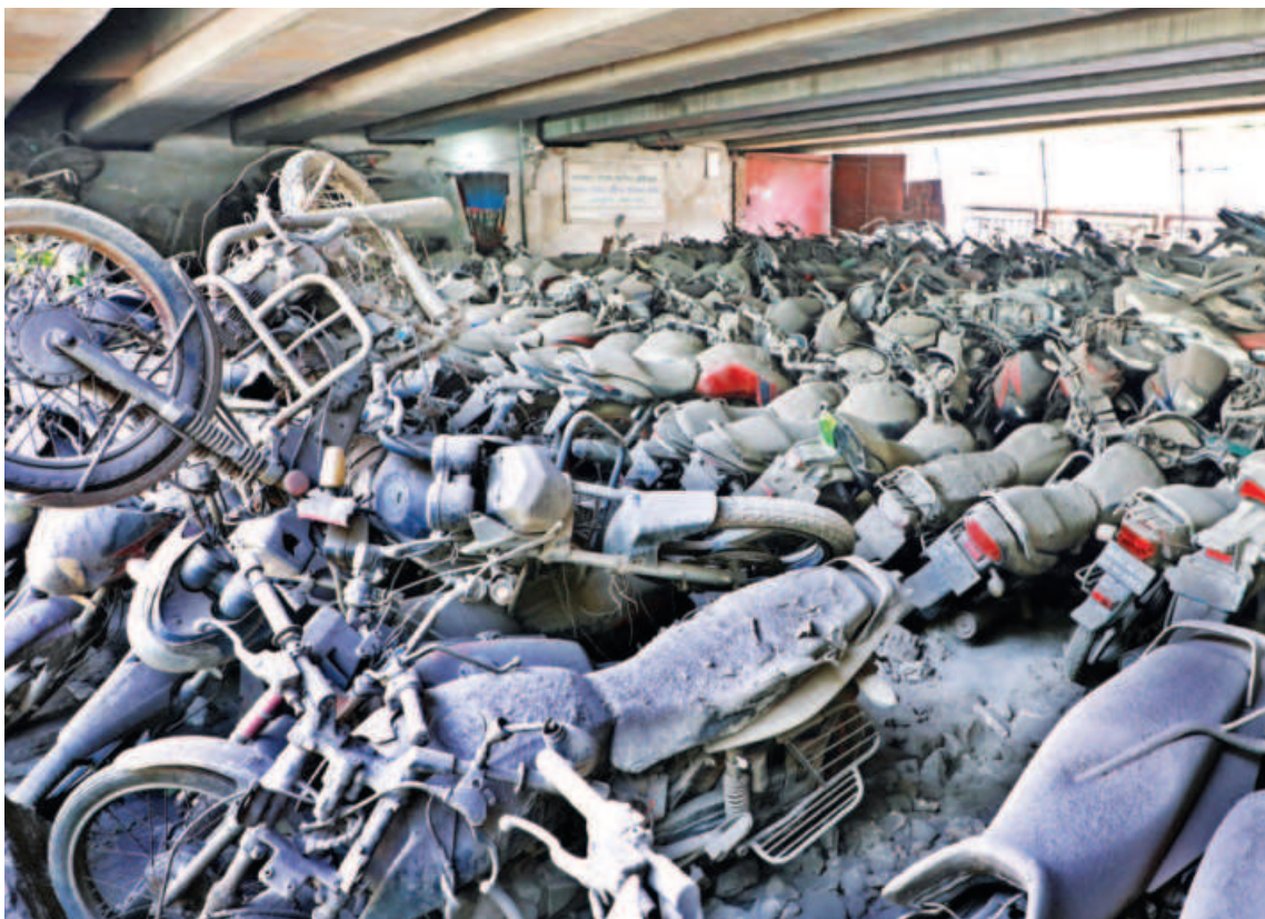
Thick layers of dust gather on impounded motorcycles kept under the capital's Moghbazar flyover. These motorcycles, seized by law enforcers from different parts of the city, are left this way due to a lack of designated space for them. The photo was taken yesterday.