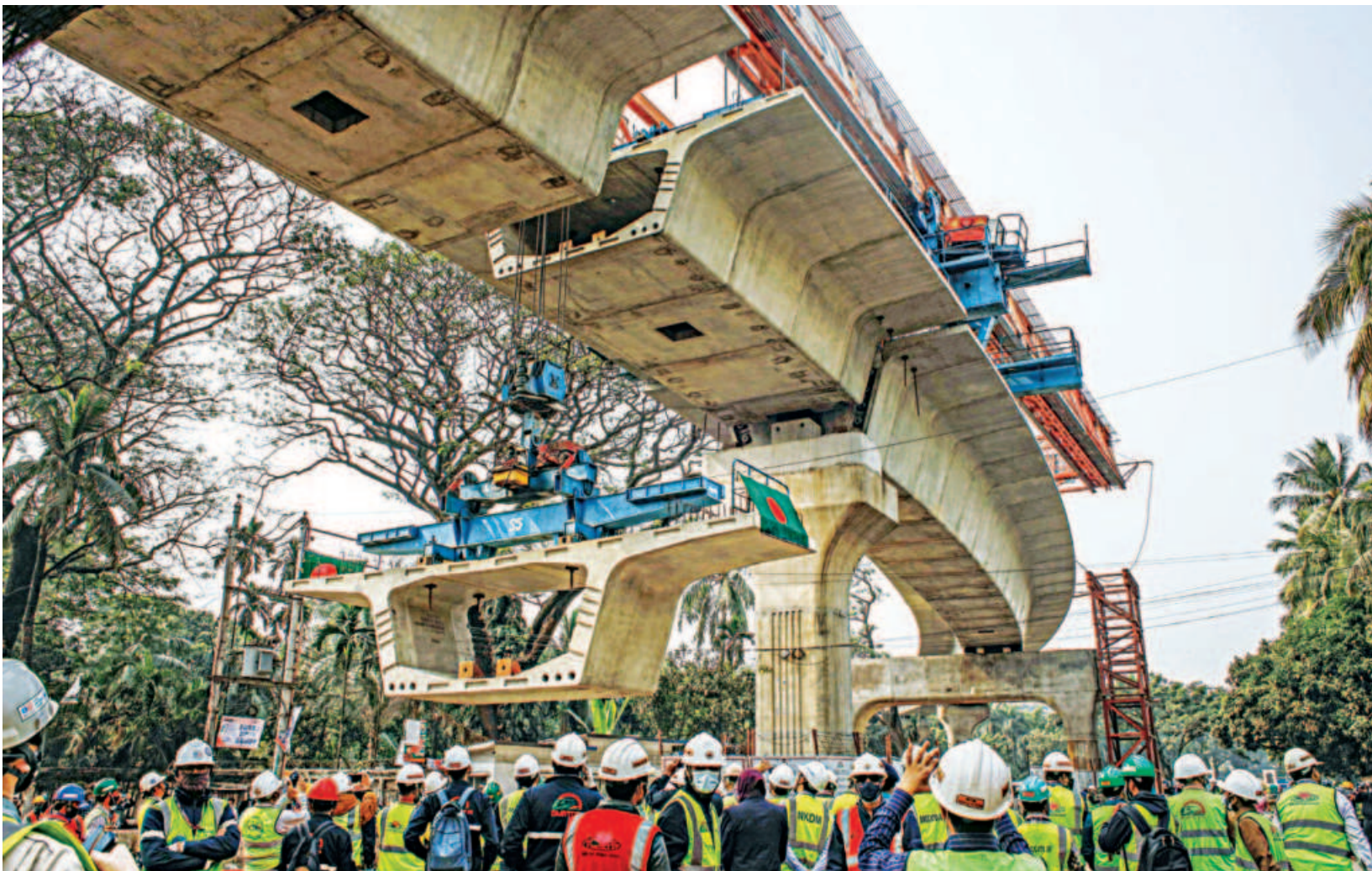
Workers and officials watch as the final segment of the metro rail's viaduct is being installed near the Jatiya Press Club around 11:15am yesterday. The entire stretch of the 20.1km viaduct -- from Uttara to Motijheel -- became visible following the installation. Story on Page 2.