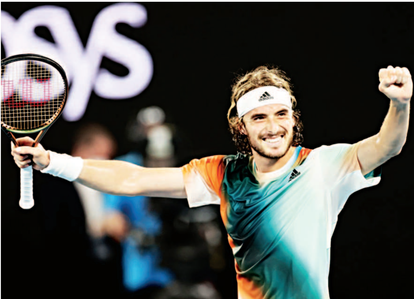
Greek star Stefanos Tsitsipas celebrates winning the men's singles quarterfinal against Italy's Jannik Sinner in the Australian Open in Melbourne on Wednesday.

"It's tough to play against him when especially he plays like this."