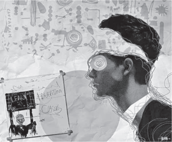
ILLUSTRATION: SALMAN SAKIB SHAHRYAR

Obviously, people need to be able to apply an analytical mind to misinformation, sifting through the lies, deceptions and garbage to see if there is anything worthwhile, and knowing where to turn for better information.