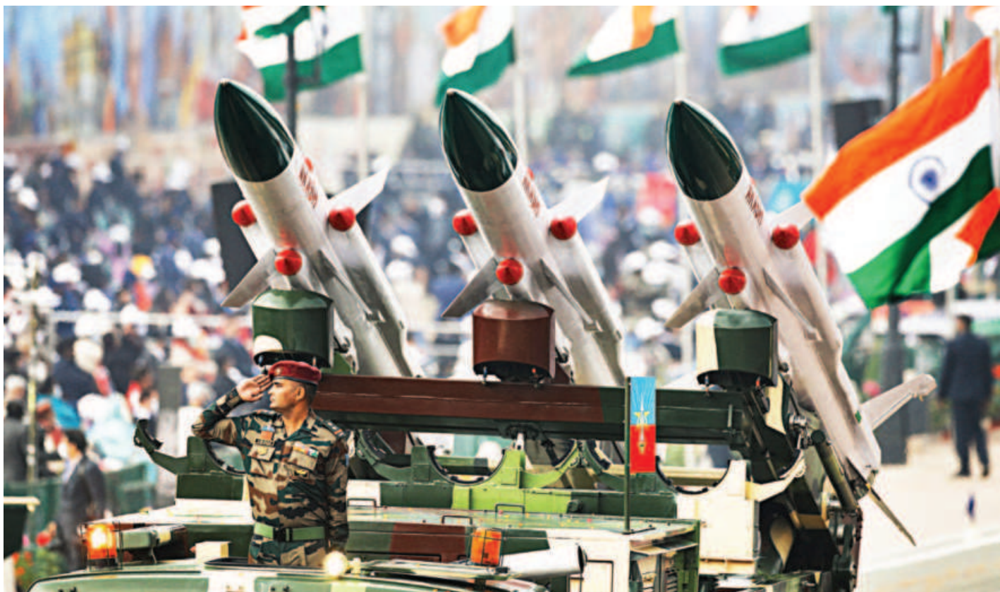
An Indian soldier salutes while standing on a vehicle during the Republic Day parade in New Delhi, India, yesterday. Lumbering tanks and the deafening roar of fighter planes echoed through New Delhi yesterday as India's military showcased its might on Republic Day. The annual January 26 event marks the adoption of India's constitution.

“Right thing to do. He wants to be Azad not Ghulam,” his tweet read.