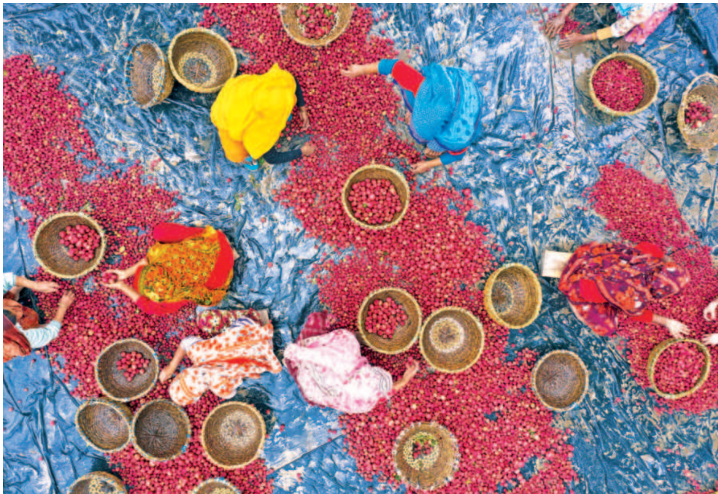
SPLASH OF RED... Traders sorting out a harvest of red potatoes at a market in Bogura's Kahaloo upazila yesterday. The potatoes, locally known as pakri aloo , were then loaded on trucks to be taken to markets in the capital.