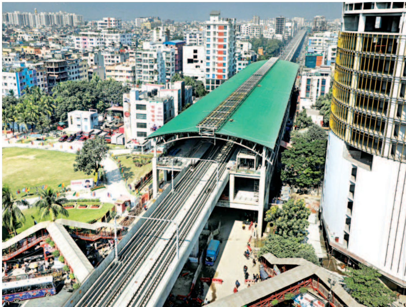
The construction work of the entire 20.1-kilometre viaduct of the country's first metro rail project is about to be finished soon. The photo was taken near Mirpur-10 intersection recently.