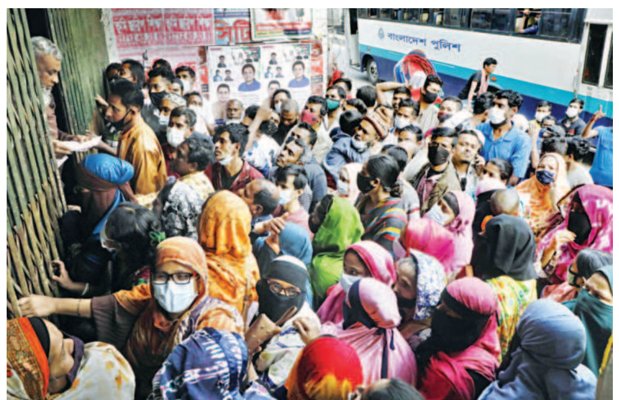
People jostling as they try to get into a vaccine centre in the capital's Dayaganj yesterday. With the number of new Covid-19 cases rising sharply every day, such disregard for health safety guidelines makes them vulnerable to the very infection they hope to be inoculated against.