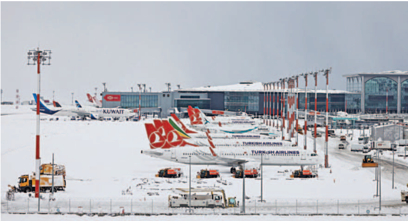
A general view of parked planes at Istanbul airport in Istanbul, Turkey, yesterday. Europe's busiest airport in Istanbul welcomed its first flight in 24 hours yesterday and Greece declared a public holiday as the eastern Mediterranean neighbours began digging themselves out of a rare snowstorm that grounded their capitals to a halt.

REUTERS, Phnom Penh Cambodian Prime Minister Hun Sen yesterday confirmed he had invited Myanmar's junta chief to a summit of the Association of Southeast Asian Nations (Asean), on the condition he makes progress on a peace plan he agreed to last year. Hun Sen, the Asean chair, said he would talk to military chief Min Aung Hlaing by video today, noting that since their Jan 7 meeting in Myanmar, ousted leader Aung San Suu Kyi had been sentenced to four years' detention and military aircraft had been deployed in operations. Min Aung Hlaing led a coup in Myanmar last year and Asean made a surprise move in barring him from key meetings over his failure to honour a five-point Asean "consensus" that included ceasing hostilities and allowing dialogue. "He (Hun Sen) said that he had invited HE (His Excellency) Min Aung Hlaing to attend the Asean summit if there was progress in the implementation of the five points agreed unanimously," said a statement on Hun Sen's Facebook page, summarising a call with Malaysian Prime Minister Ismail Sabri Yaakob. "But if not, he must send a non-political representative to Asean meetings." As new chair of Asean, Cambodia has indicated it wants to engage not isolate the junta, but Hun Sen has been pressed by several Asean leaders, including those of Malaysia, Indonesia and Singapore, not to give way on the agreement, which is backed by the United Nations and United States.