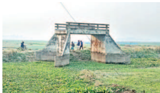
This bridge at Ramakantapur village in Pabna's Sujanagar upazila is virtually useless due to lack of approach roads.