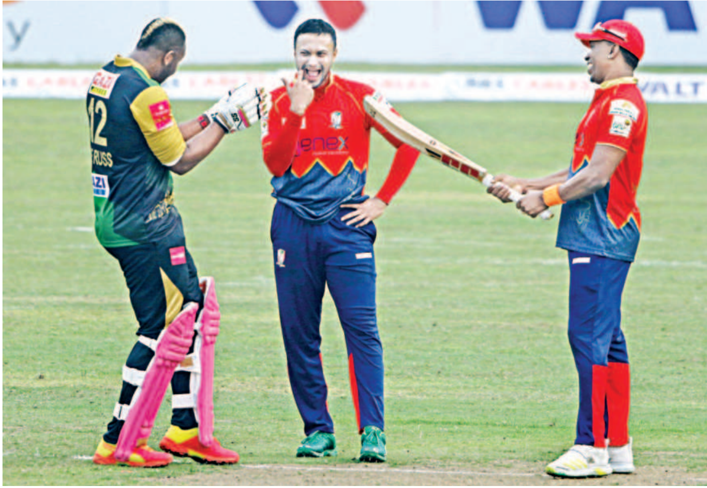
Shakib Al Hasan (C), Andre Russell (L) and Dwayne Bravo enjoy their time in the middle during Barishal Fortune's BPL match against Minister Group Dhaka in Mirpur yesterday. They had reason to be jolly – Shakib getting into the 400-wicket club in T20s while Russell and Bravo both making their mark both with bat and ball. (Bottom) Andre Fletcher's nasty injury though, during the second match of the day between Chattogram Challengers and Khulna Tigers, left everyone concerned.

Sylhet's Caribbean wicket-keeper batter Lendl Simmons, who missed out on the first game but expected to return to the side, informed that assessing the pitch will be the key for the teams in the ongoing eighth edition of the