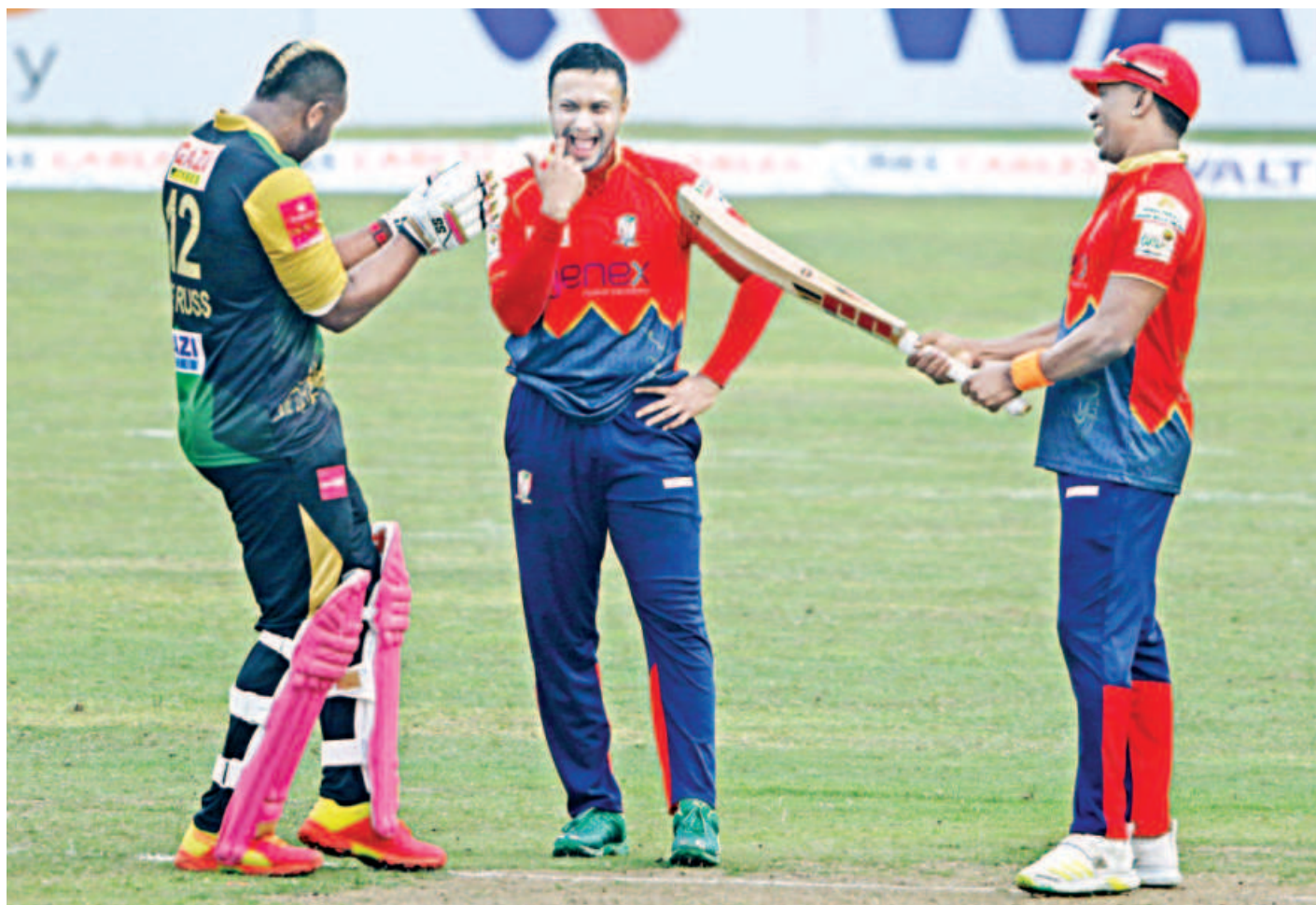
Shakib Al Hasan (C), Andre Russell (L) and Dwayne Bravo enjoy their time in the middle during Barishal Fortune's BPL match against Minister Group Dhaka in Mirpur yesterday. They had reason to be jolly – Shakib getting into the 400-wicket club in T20s while Russell and Bravo both making their mark both with bat and ball. (Bottom) Andre Fletcher's nasty injury though, during the second match of the day between Chattogram Challengers and Khulna Tigers, left everyone concerned.

Sylhet's Caribbean wicket-keeper batter Lendl Simmons, who missed out on the first game but expected to return to the side, informed that assessing the pitch will be the key for the teams in the ongoing eighth edition of the