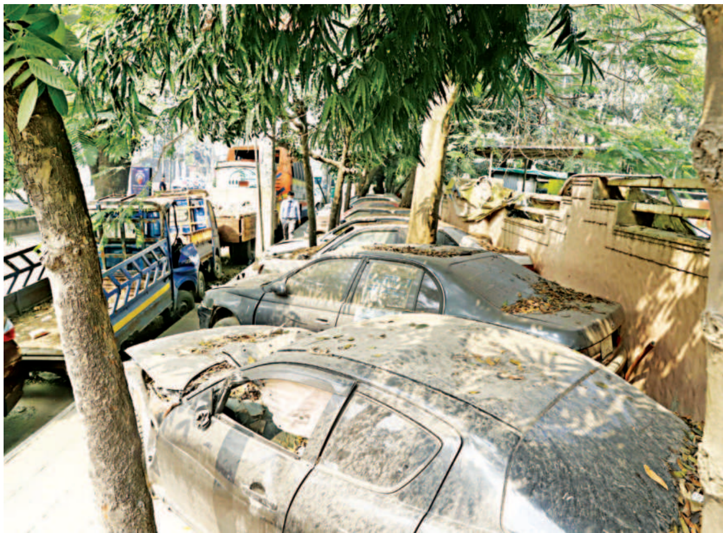
These vehicles, seized by police, are left opposite to the capital's Gulshan Police Station, occupying the street and the footpath. The vehicles have been kept there as there is no room inside the police station or a designated place to keep them. The photo was taken recently.

Prime Minister Sheikh Hasina will hand over the awards at Amar Ekushey Book Fair.