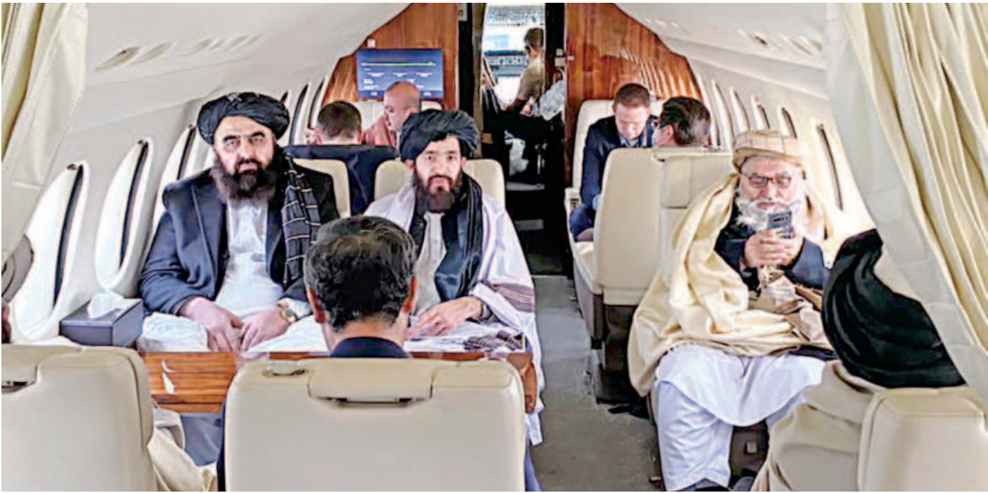
This handout photograph released by the Afghan Taliban and taken on Saturday shows Afghanistan’s Foreign Minister Amir Khan Muttaqi (L), Taliban spokesman for the Ministry of Foreign affairs, Abdul Qahar Balkhi (C) and delegates sitting on a plane before departing to Oslo, at the Kabul airport in Kabul. The first Taliban delegation to visit Europe since returning to power in Afghanistan began talks yesterday in Oslo with Afghan civil society members focused on human rights, ahead of highly-anticipated meetings with Western officials. The talks, facilitated by Norway to avert a humanitarian crisis, were taking place behind closed doors at the Soria Moria Hotel on the outskirts of Oslo.

Omicron, the highly-transmissible Covid 19 strain driving the ongoing third wave of the pandemic across India, is in “community transmission stage” in the country, said a report released yesterday by a consortium of labs of the Indian government. The government’s Covid research lab, which tracks genome sequencing of various strains of the disease, also said BA.2 lineage, an infectious sub-variant of Omicron, has been detected in India.” “Omicron is now in community transmission in India and has become dominant in multiple metros, where new cases have been rising exponentially,” said the January 10 bulletin of the Indian SARS-CoV-2 Consortium on Genomics or Indian SARS-CoV-2 Genetics Consortium (INSACOG). The bulletin was made public yesterday. “Further spread of Omicron in India is now expected to be through internal transmission,” the INSACOG under the Indian Health Ministry said. India yesterday reported 333,533 new Covid-19 infections over the past 24 hours with 525 dead. On Saturday, India had reported 337,704 new cases and 488 dead. The government in the statement said the recovery rate for infected people currently stands at 93.18%. India said it tested 1.87 million people in the last 24 hours and it planned to continue to expand its testing through the country.