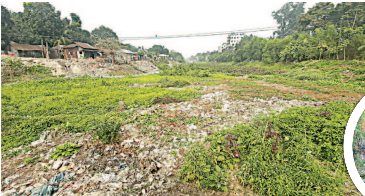
The might of Louhajang is almost gone. From a river that once let launches and goods-laden boats pass, it has virtually become a ditch today.