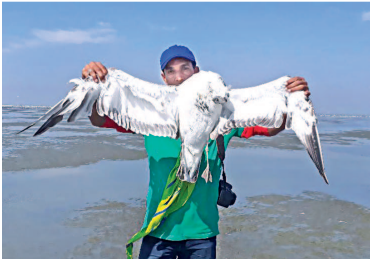
A tourist holding up a dead bird found lying at the Char Bijoy. Poachers are active throughout the area killing these visiting birds with nets and traps.