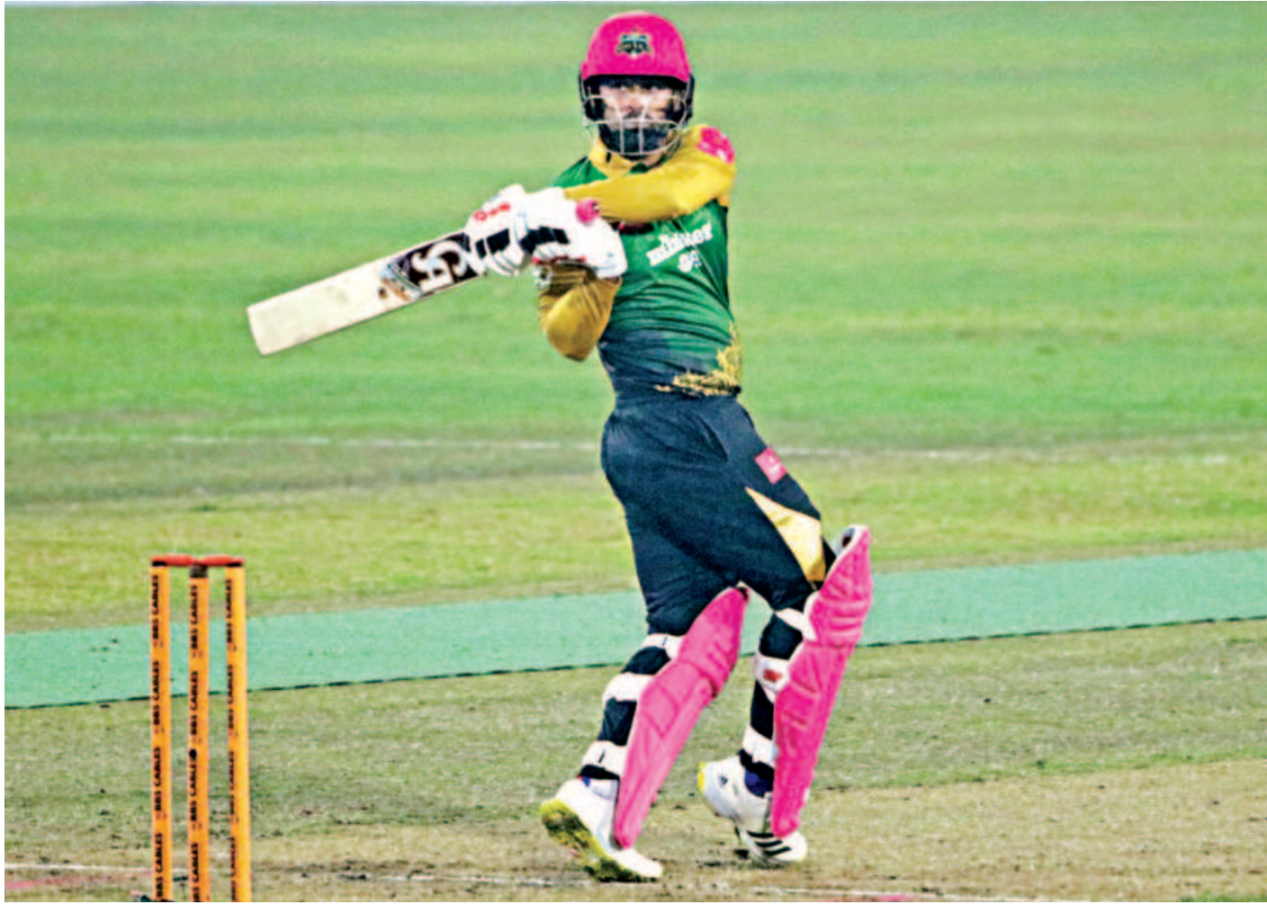
Minister Group Dhaka opener Tamim Iqbal swivels on his feet to smash one towards the third man boundary during their Bangabandhu BPL fixture against Khulna Tigers in the second match of the opening day at the Sher-e-Bangla National Stadium in Mirpur yesterday. Tamim scored 50 off 42 balls as Dhaka posted 183 for six.

Asked if he has learned a Bangla word yet, he responded: "Not yet. I am just getting in some local food. Had biryani yesterday so it's good. Seen guys making guava with chilli and lime and its very nice," he said.