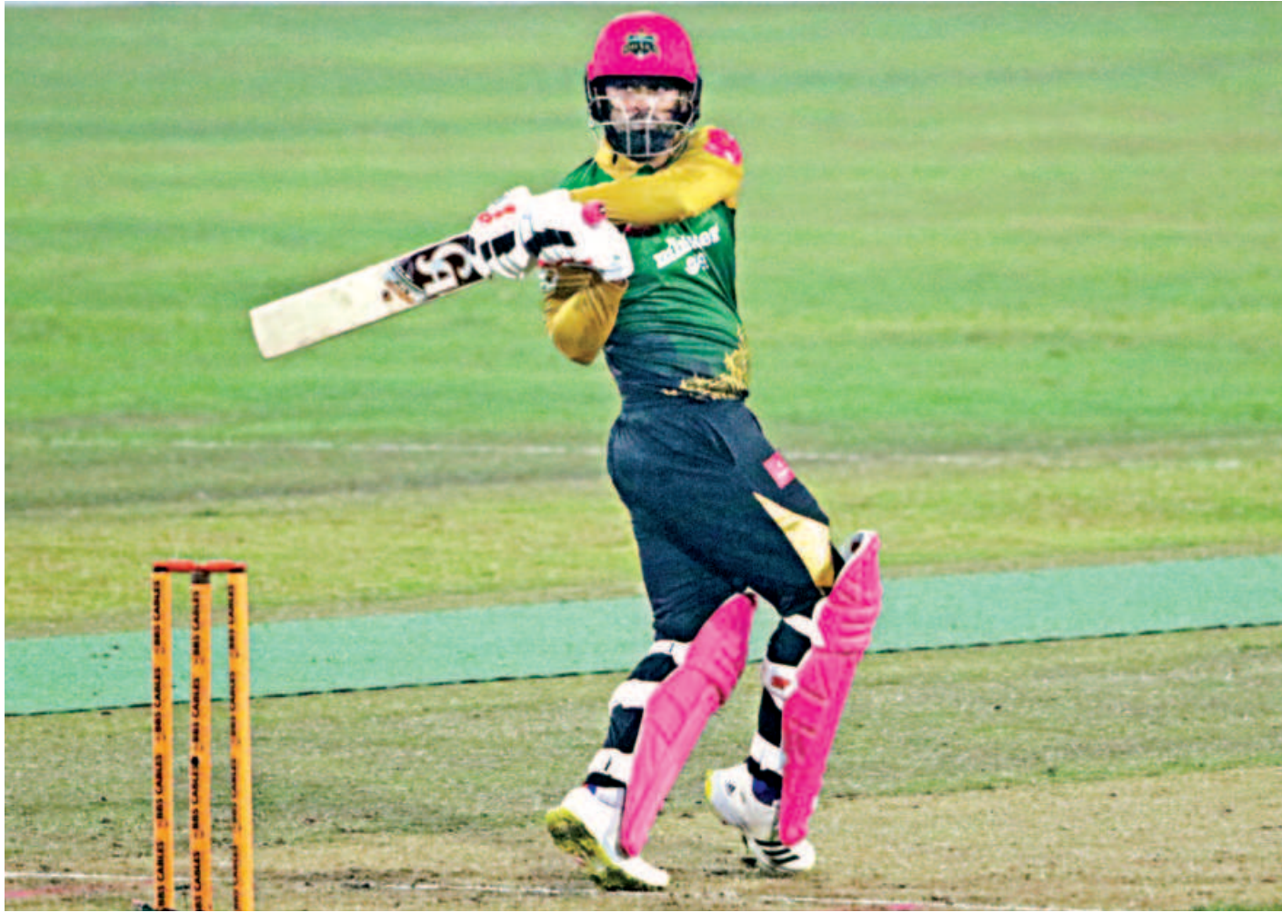
Minister Group Dhaka opener Tamim Iqbal swivels on his feet to smash one towards the third man boundary during their Bangabandhu BPL fixture against Khulna Tigers in the second match of the opening day at the Sher-e-Bangla National Stadium in Mirpur yesterday. Tamim scored 50 off 42 balls as Dhaka posted 183 for six.

Asked if he has learned a Bangla word yet, he responded: "Not yet. I am just getting in some local food. Had biryani yesterday so it's good. Seen guys making guava with chilli and lime and its very nice," he said.