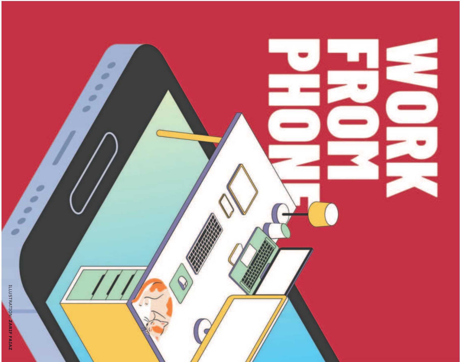
ILLUSTRATION: ZARIF FAIAZ