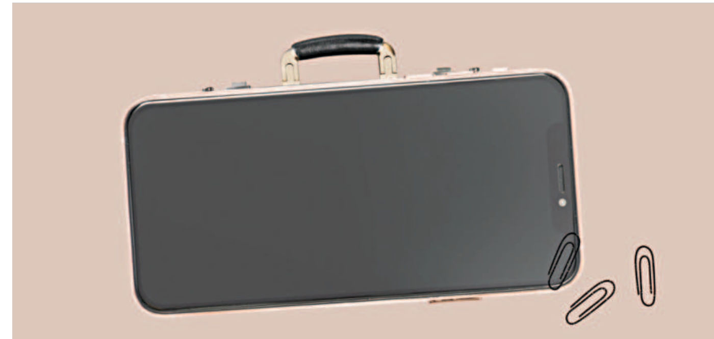
ILLUSTRATION: ZARIF FAIAZ

One device offering the benefits of many devices is what we expect from our work phones. Smartphones can be your primary or secondary work device based on your preferences. What works for one might not work for another. Yet, since we have access to such options, thanks to technology, you can check out all the different options at your disposal to comprehend which method suits you the best.