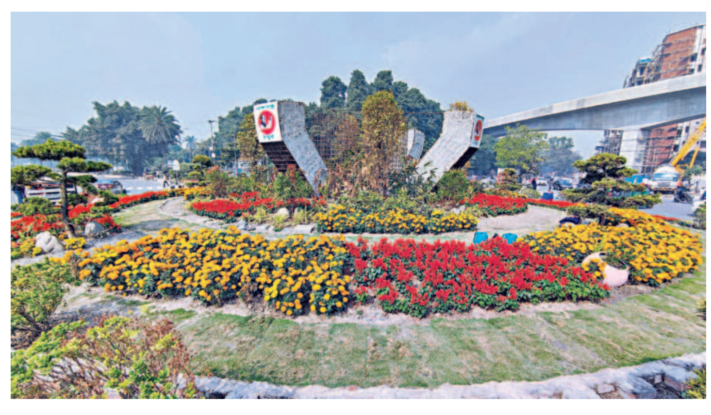
The Bangabandhu Chattar in the capital's Khamarbari area had turned into a mishmash of shrubs, bushes and garbage due to the lack of maintenance. But since last month, the spot has been given a new face, after Dhaka North City Corporation started working to beautify it. This photo was taken yesterday.

The notice recommends four provinces and HCs in Dhaka, Chattogram, Rajshahi and Khulna.