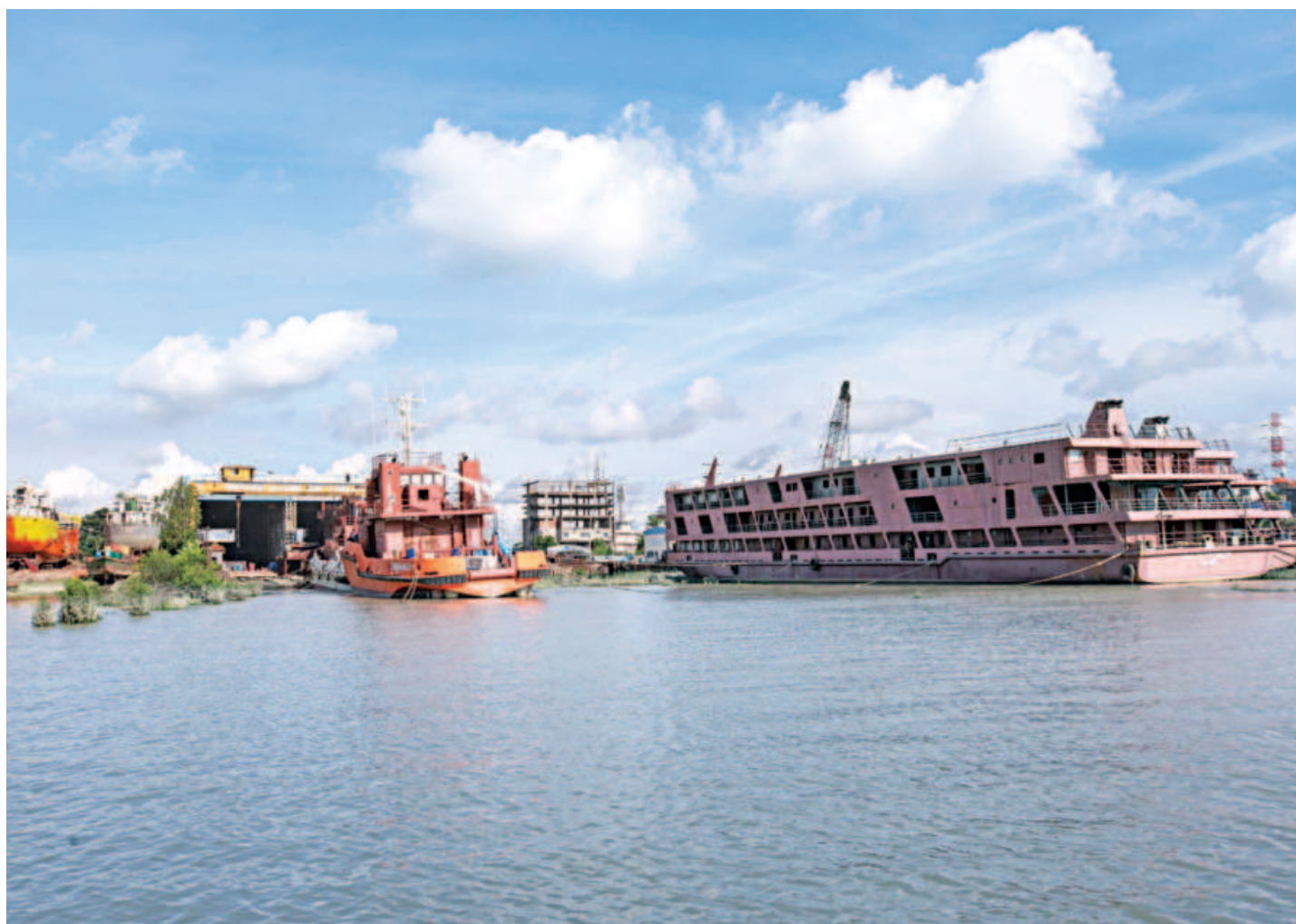
Bangladesh Bank in April 2018 relaxed the loan repayment facility for the shipbuilding industry, allowing them to pay the loans in 10 years with a grace period of three years.