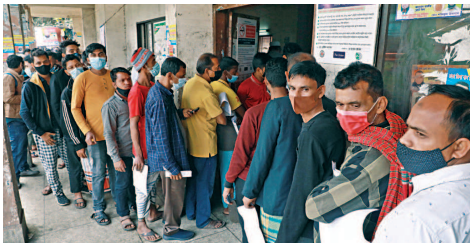
Bus drivers and helpers of Mohakhali terminal stand in line to get vaccinated at the Dhaka District Bus Minibus Road Transport Workers Union office yesterday -- the first day of the government's special inoculation drive for road transport workers, which will gradually expand to Sayedabad, Gabtoli and Phulbari terminals later. Story on page 3.

India reported new infections at an eight-month high and a government scientist warned it will take weeks before data on hospitalisations and deaths will show how severe the latest wave driven by the Omicron variant will be.