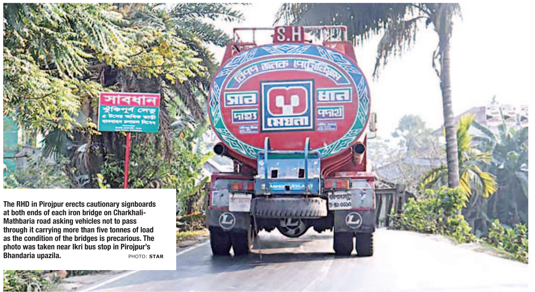
The RHD in Pirojpur erects cautionary signboards at both ends of each iron bridge on Charkhali-Mathbaria road asking vehicles not to pass through it carrying more than five tonnes of load as the condition of the bridges is precarious. The photo was taken near Ikri bus stop in Pirojpur's Bhandaria upazila.

"We hope that the project will be passed by the Executive Committee of the National Economic Council (ECNEC) soon," he added.