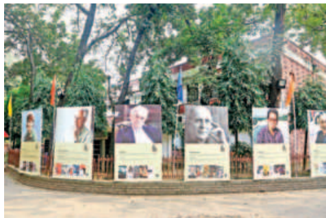
The entrance of DIFF's venue at the Public Library.

The submitted films are being screened at multiple venues across Dhaka – Sufia Kamal Auditorium and Main Auditorium at National Museum in Shahbagh, Alliance Francaise de Dhaka in Dhanmondi, National Art Gallery Auditorium and Auditorium of National Music and Dance at Bangladesh