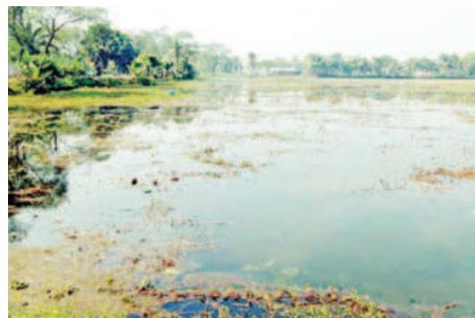
A waterlogged Boro field in Jashore's Monirampur upazila.