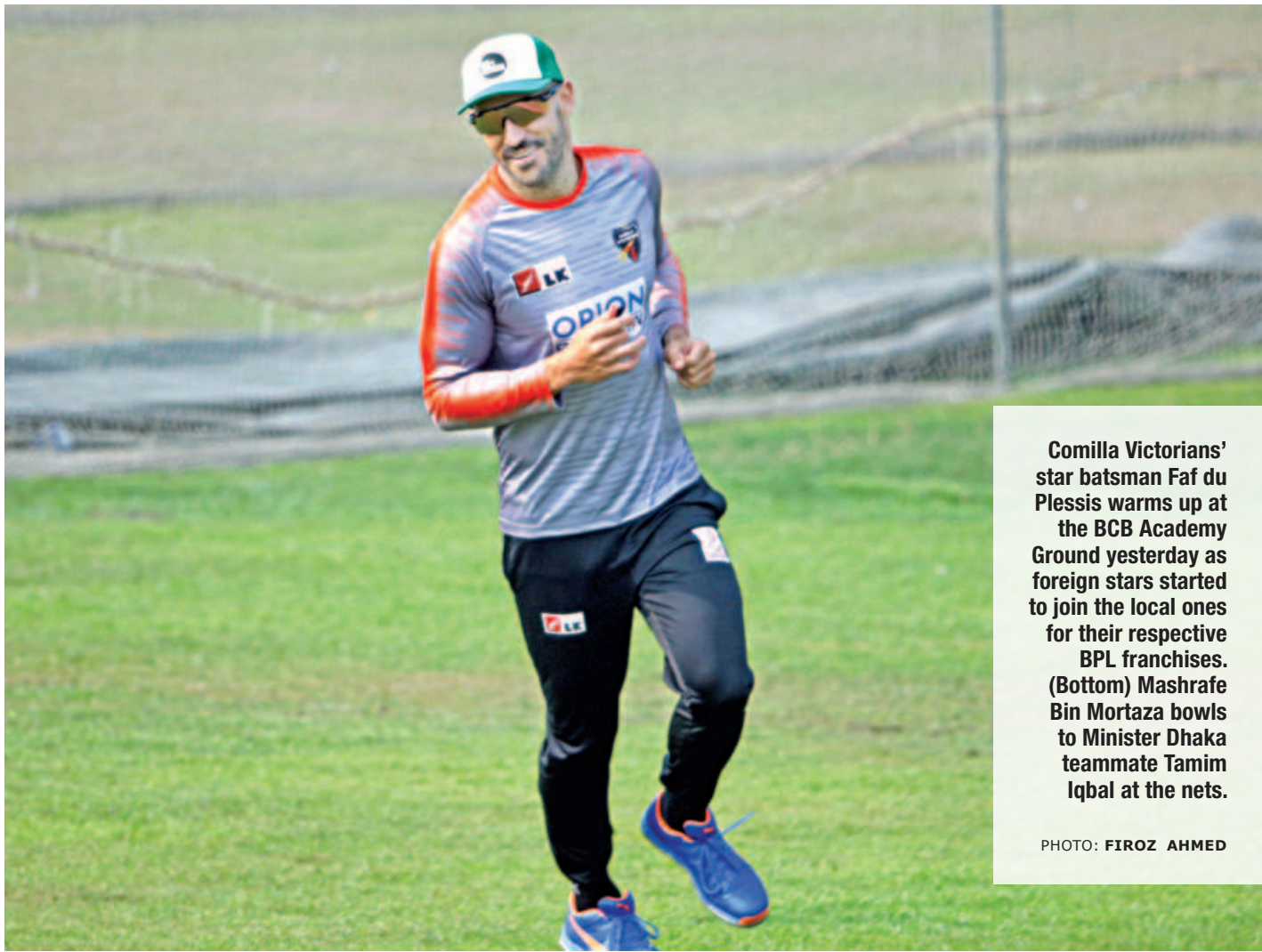
Comilla Victorians' star batsman Faf du Plessis warms up at the BCB Academy Ground yesterday as foreign stars started to join the local ones for their respective BPL franchises. (Bottom) Mashrafe Bin Mortaza bowls to Minister Dhaka teammate Tamim Iqbal at the nets.

They won five successive European Cups from 1956 to 1960 with Gento surviving a cull of that generation by former teammate-turned-manager Miguel Munoz and going on to lift the trophy for a sixth time in 1966.