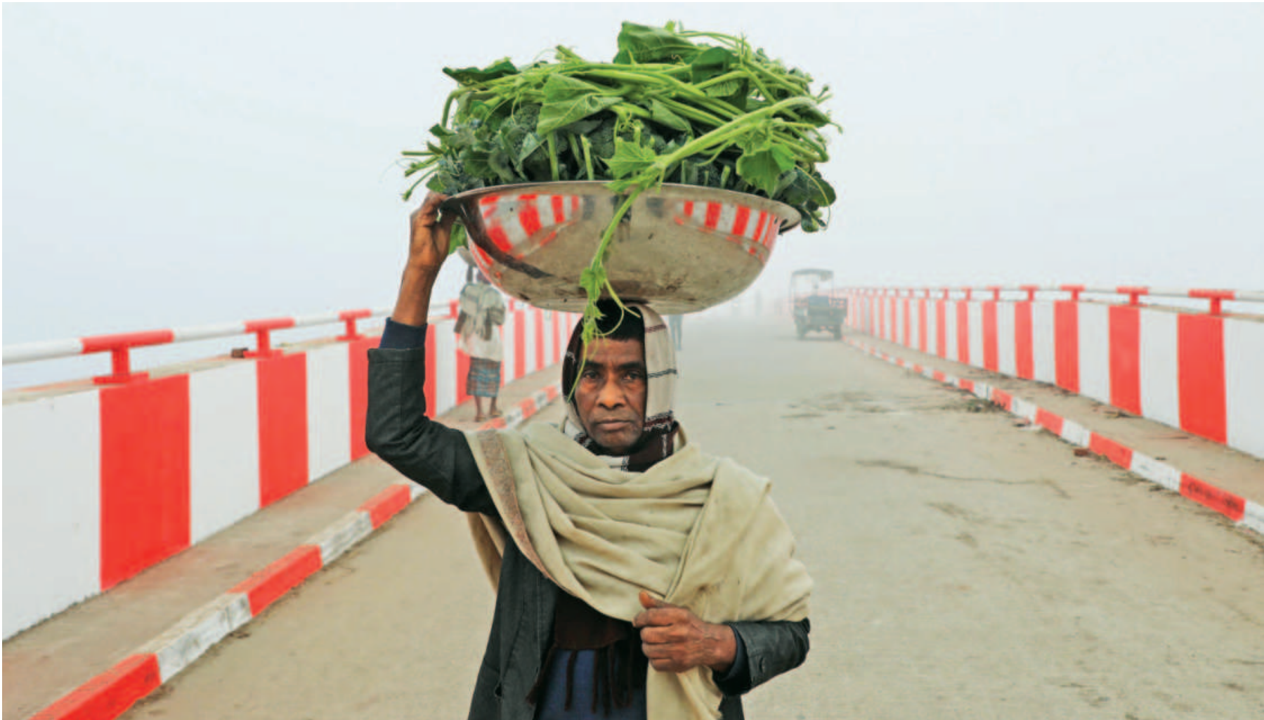
Balancing a bunch of fresh produce on his head, this man is on his way to sell his goods at the nearby kitchen market. Even though the roads are barely visible due to the winter-morning fog, the seller, clad in warm clothes, does not seem to be fazed. This photo was taken recently from Dhamrai’s Royail area.