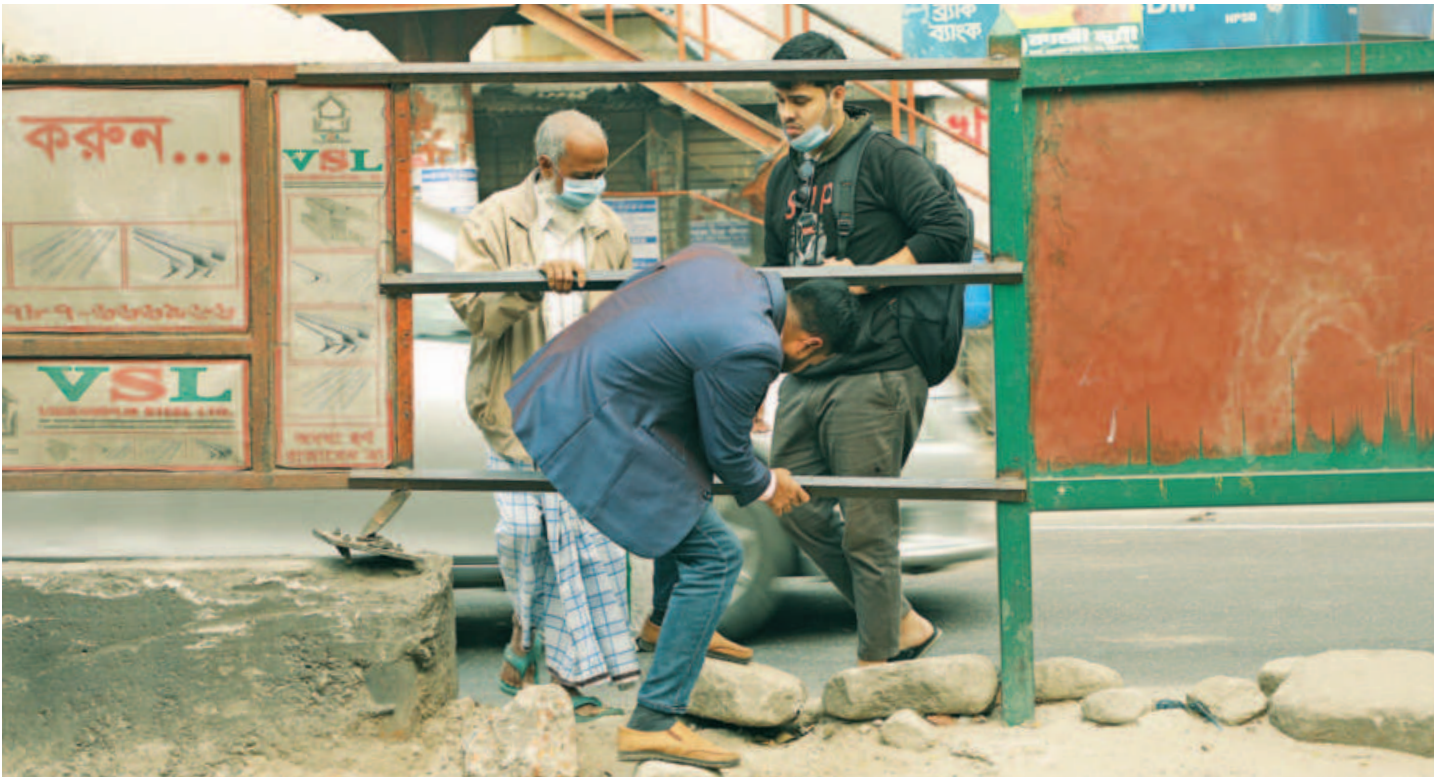
Even though the footbridge is right within reach, a person goes through the hassle of contorting his body to pass through the road divider in Basabo area yesterday. And two other like-minded individuals are waiting for their turn. Such activities makes one wonder whether people do it for convenience or to save time. But there’s no doubt about the fact that this is quite dangerous and a clear violation of traffic rules.

The notifications said judicial activities of all the benches of the Appellate and High Court Divisions will be conducted under the Usage of Information Technology by Courts Act, 2020 and following the practice directions issued by the then chief justice in 2020 for maintaining health guidelines from January 19.