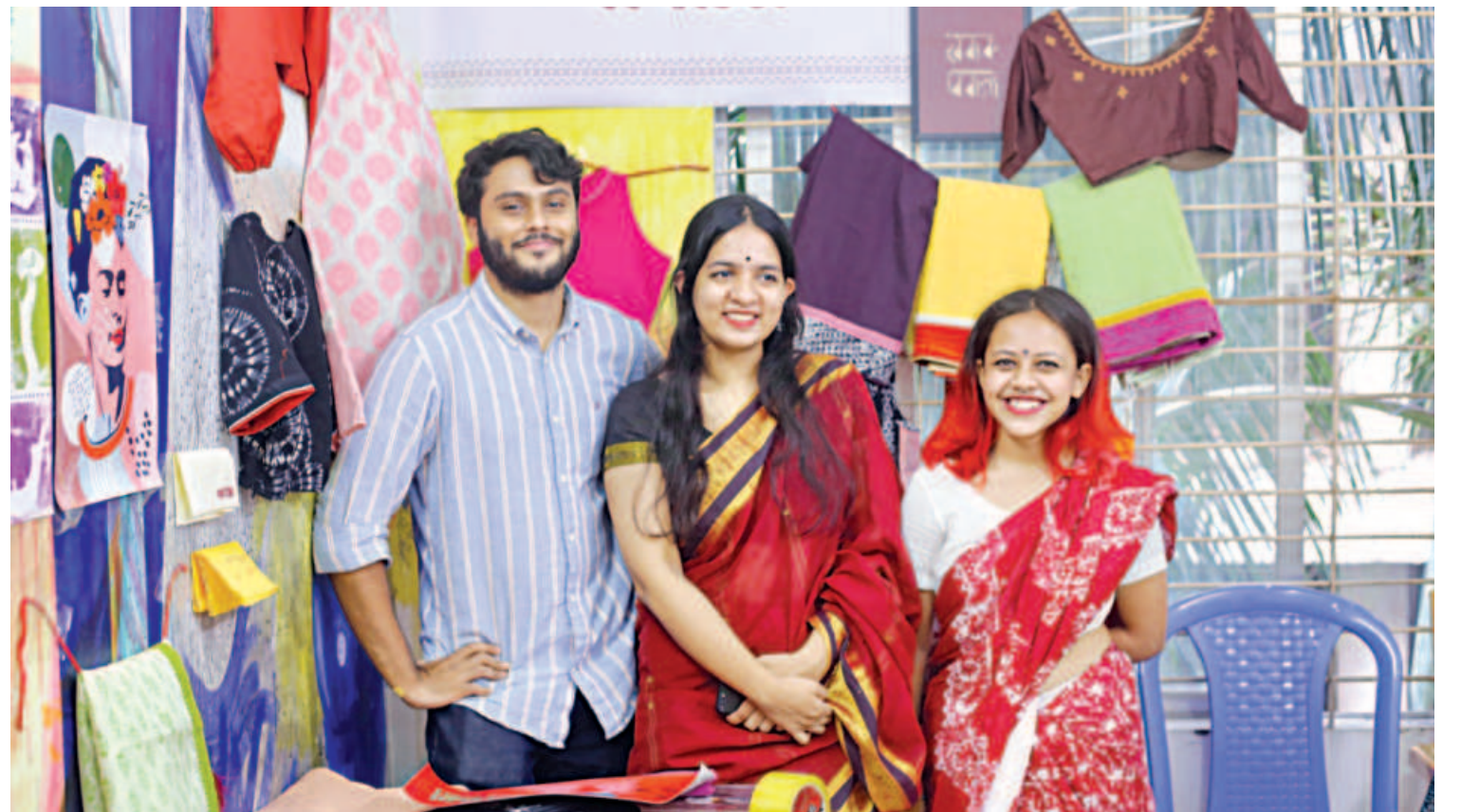
Jongshon puts up stalls that sells a variety of home-grown products by SMEs and ventures they support.