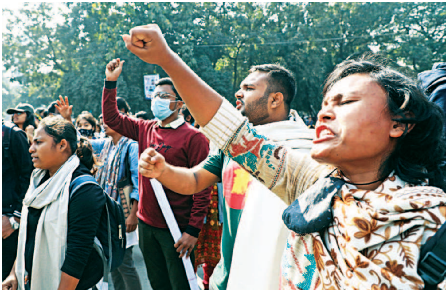
SOLIDARITY WITH SUST... Protesting the police attack on students of Shahjalal University of Science and Technology on Sunday night, students of Dhaka University bring out a procession in TSC area yesterday.