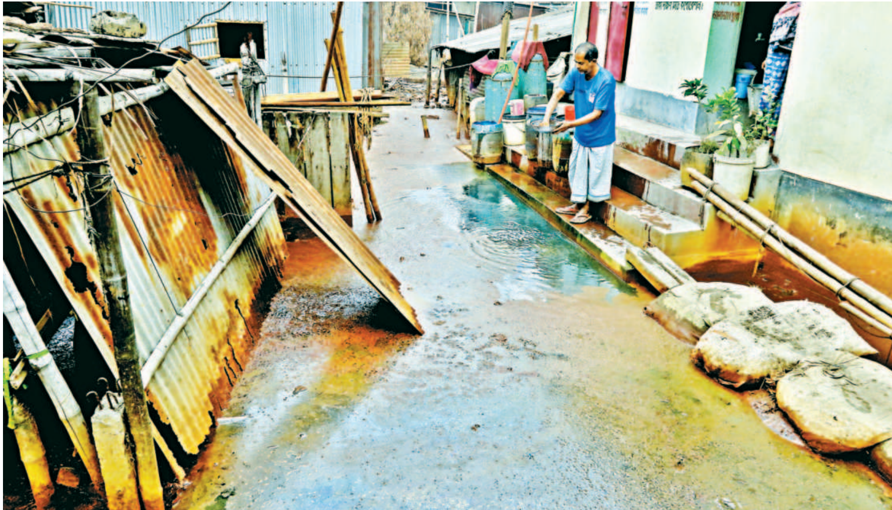
From wading knee-deep water to staying in inundated homes, the residents of Shyampur's Dhaka Match Factory area in no way deserve to live like this. But a botched development work made their lives miserable last year, and since then, dealing with such misfortune has become a chore.