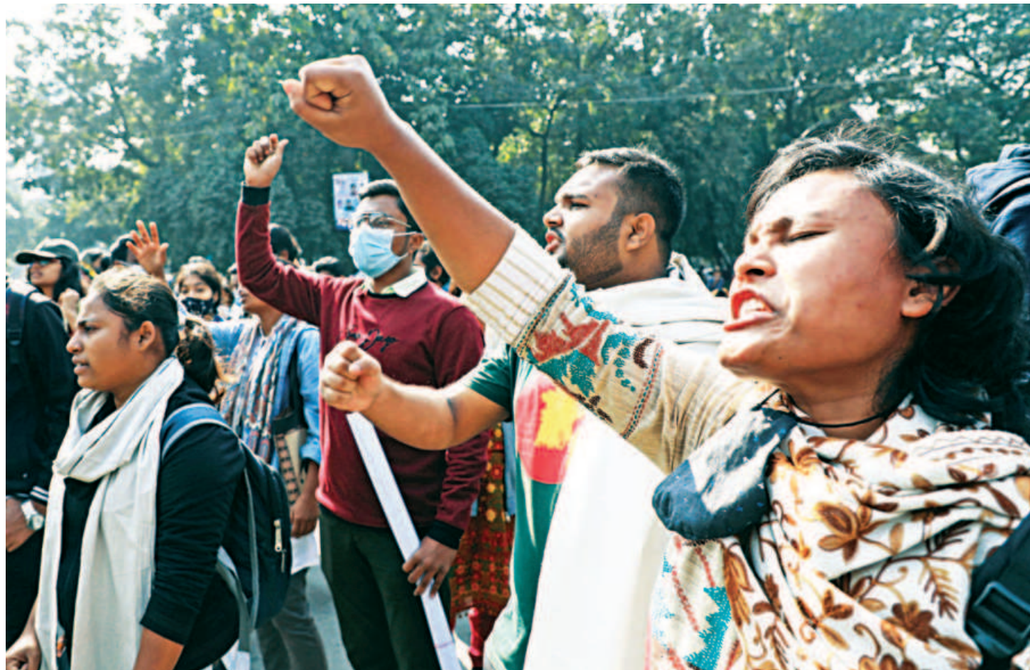
SOLIDARITY WITH SUST... Protesting the police attack on students of Shahjalal University of Science and Technology on Sunday night, students of Dhaka University bring out a procession in TSC area yesterday.