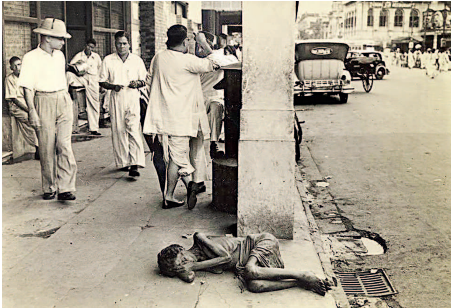
Dying woman on the streets of Calcutta, 1945.

In the wake of WWI, the price of agricultural commodities collapsed, credit dried up completely, and destitution and despair were widespread, particularly in the eastern districts of Bengal. The index price of jute, set at 100 in 1914, had collapsed a full 60% by 1934. Satish Chandra Mitter in his Recovery Plan for Bengal , written that same year, warned: "it is evident to anyone familiar with agricultural conditions...and with the lives of the cultivators...that they exist rather than live, and that the margin between starvation and existence is an extremely small one." [Mitter, S.C. A Recovery Plan for Bengal . (Calcutta: The Book Company, 1934) p. 42.] Agricultural laborers had been driven to abject destitution, malaria was decimating the province every winter, the fisheries were in ruins, cottage industries were bankrupt, and flood control was