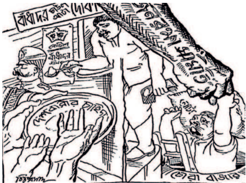
Sketch by Chittaprosad. Published in Janayuddha, January 27, 1943.

The mantra of feeding industrial Calcutta had quickly become synonymous with the