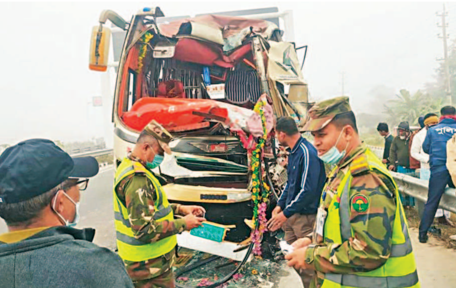
One person was killed and 10 were injured as this bus hit a cement-carrying covered-van from behind on Dhaka-Mawa Expressway in Sreenagar upazila of Munshiganj yesterday morning.

The injured were taken to Brahmanbaria General Hospital, said the OC.