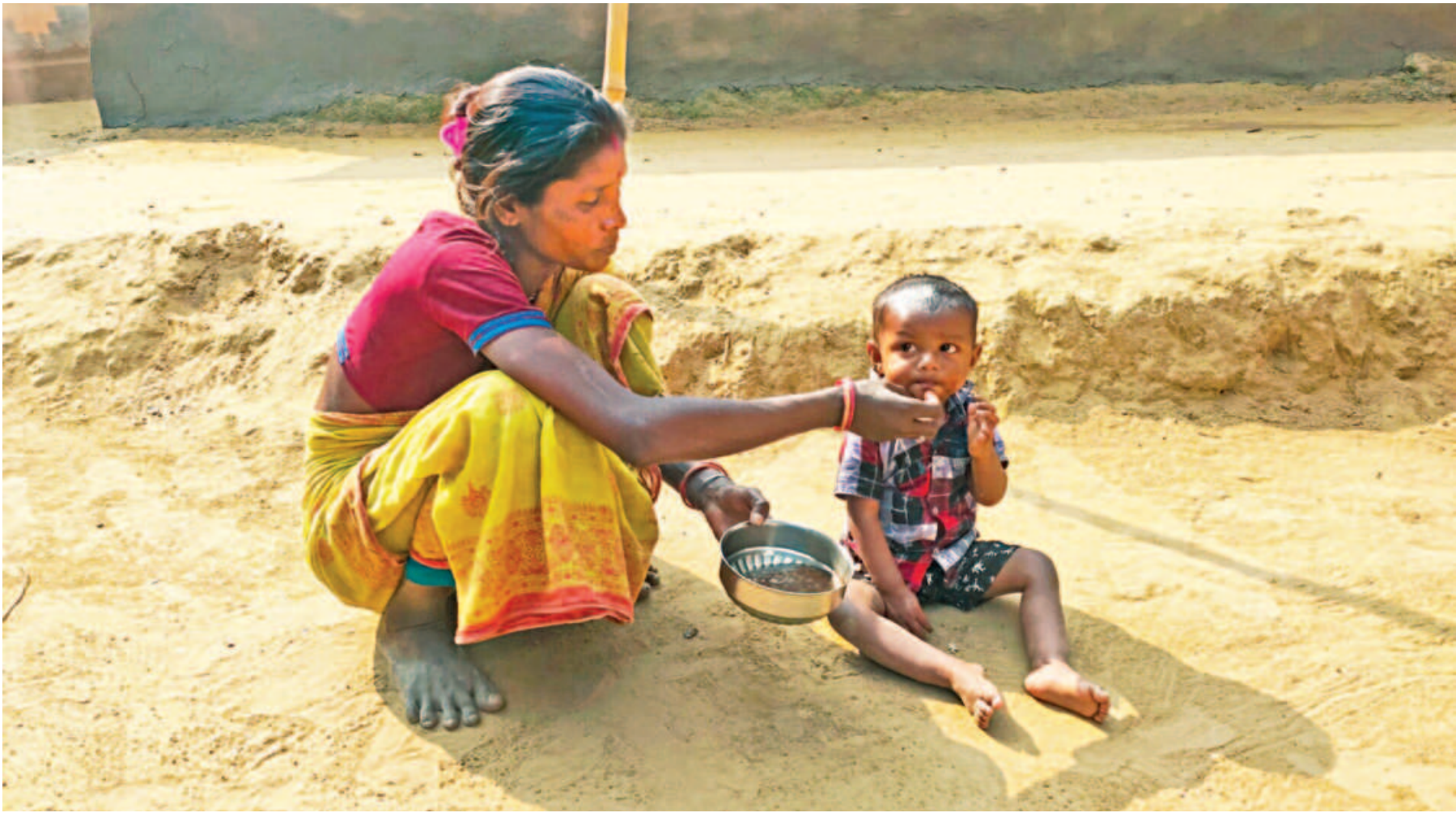
It has been more than a month since Baikunthapur Tea Garden has been shut down. This has pushed the workers and their families' backs to the wall. Exhausting what meagre savings they made from their Tk 120 per day wages, some of them are taking out loans to feed their families. This photo was taken on Wednesday.