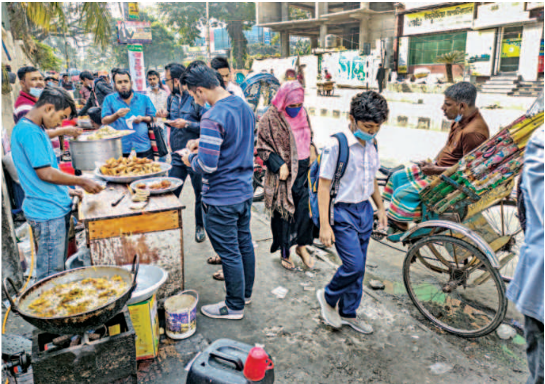
Walking on the capital's streets is turning into an ordeal with each passing day. Owing to encroachment by vendors, the footpaths are no longer pedestrian-friendly. With Covid cases on the rise once again, this has become even riskier as no social distancing can be maintained in this setup. The photo was taken from Green Road area yesterday.

Meanwhile, Ain O Salish Kendra yesterday demanded action against the perpetrators behind Wednesday's attack.