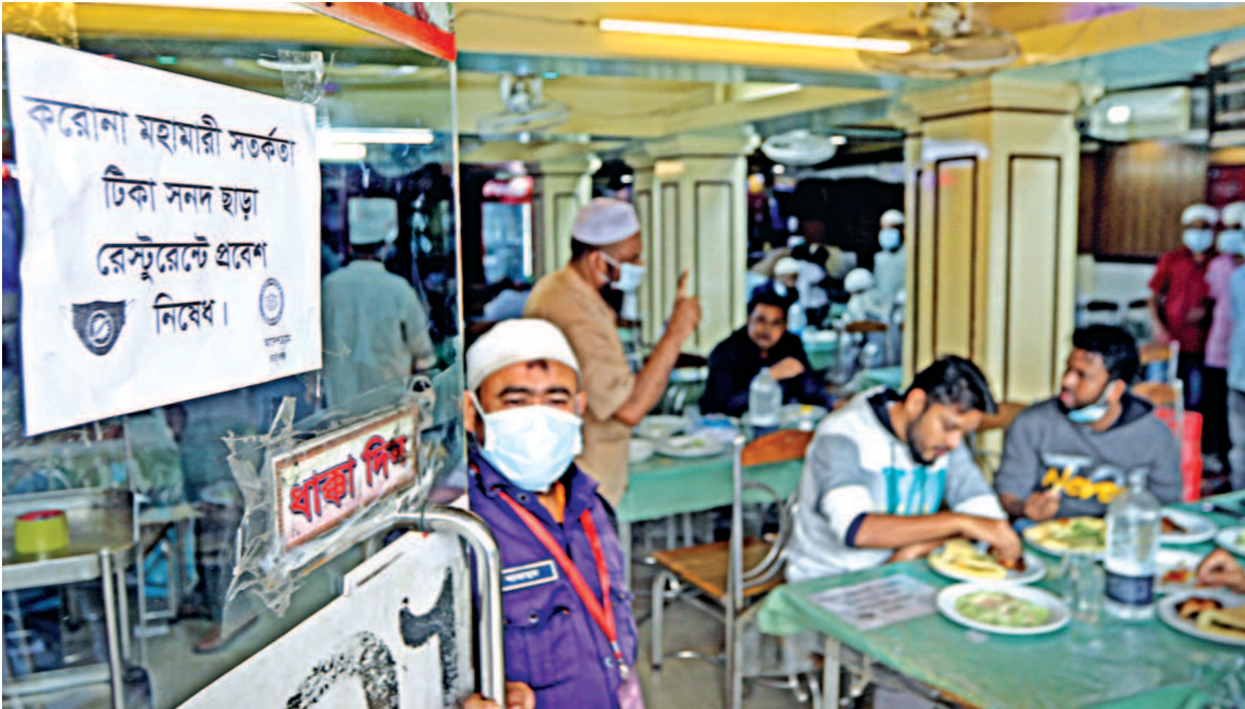
The government has issued an 11-point instruction to curb the spread of Omicron, yet another Covid variant. Under the new guidelines, one needs to show a vaccination certificate against Covid-19 to avail restaurant services. The photo was taken yesterday from the capital's Paltan area.

Recruiting agents and labour migration activists said they're afraid that the syndicate will manipulate the recruitment process in a rehash of the 2016-18 period.