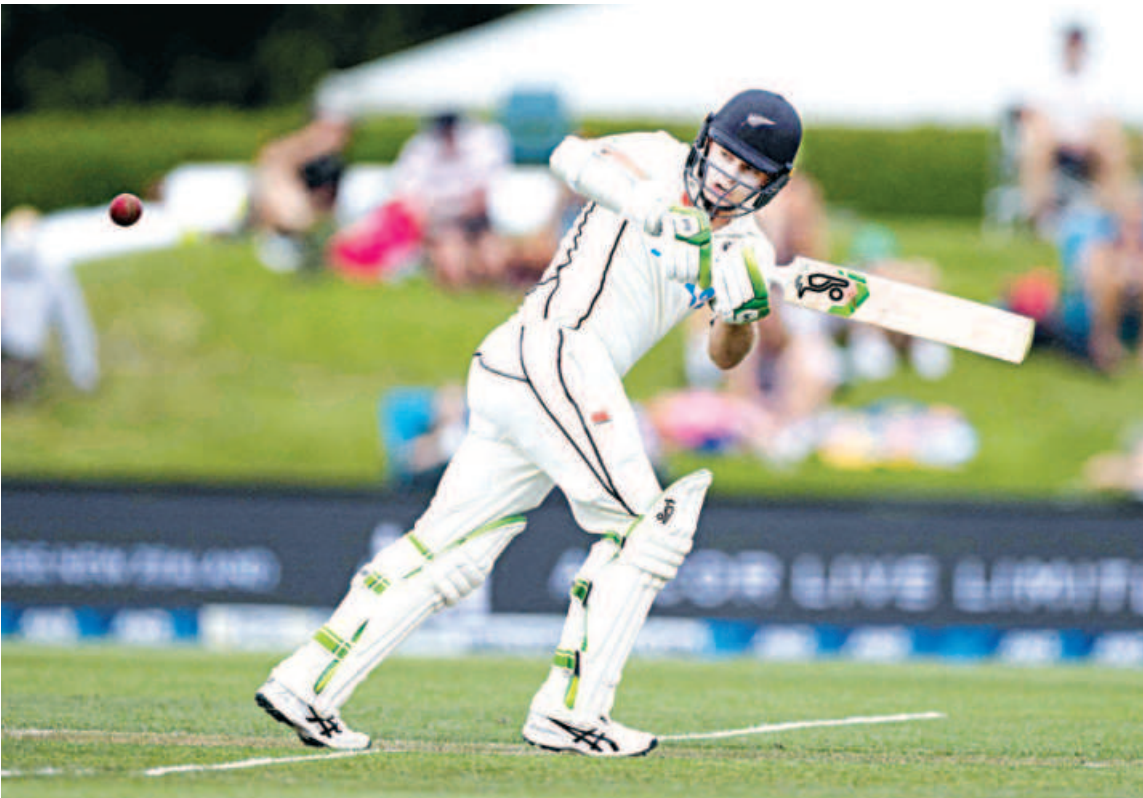
New Zealand's captain Tom Latham plays a shot during the first day of the second Test between New Zealand and Bangladesh in Christchurch yesterday. He ended the first day with an unbeaten 186.