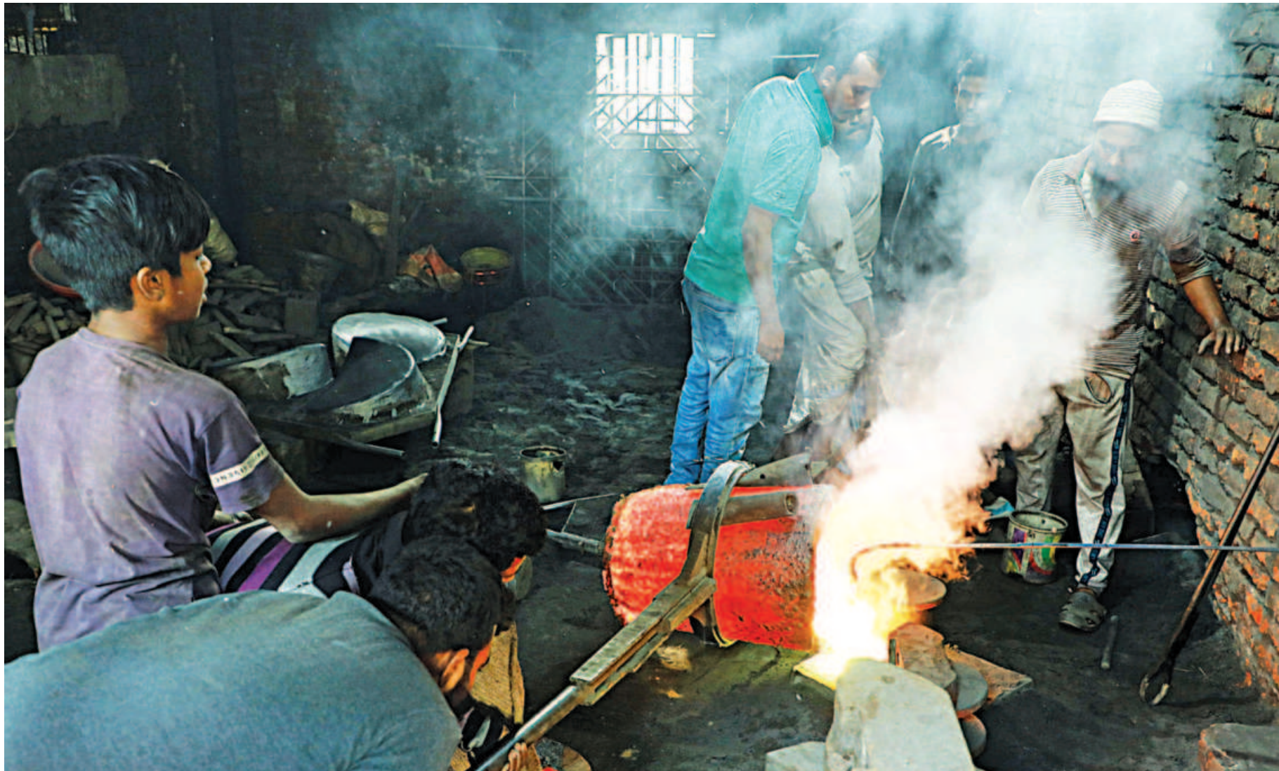
Workers casting metal to make various ship equipment at a shipyard in Keraniganj's Aganagar. A lot of risk is involved in the work but people and children are seen working there without any safety gear. This photo was taken recently.