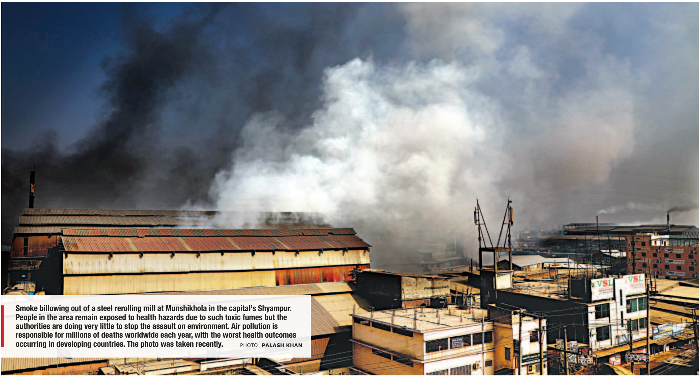
Smoke billowing out of a steel reolling mill at Munshikhola in the capital's Shyampur. People in the area remain exposed to health hazards due to such toxic fumes but the authorities are doing very little to stop the assault on environment. Air pollution is responsible for millions of deaths worldwide each year, with the worst health outcomes occurring in developing countries. The photo was taken recently.