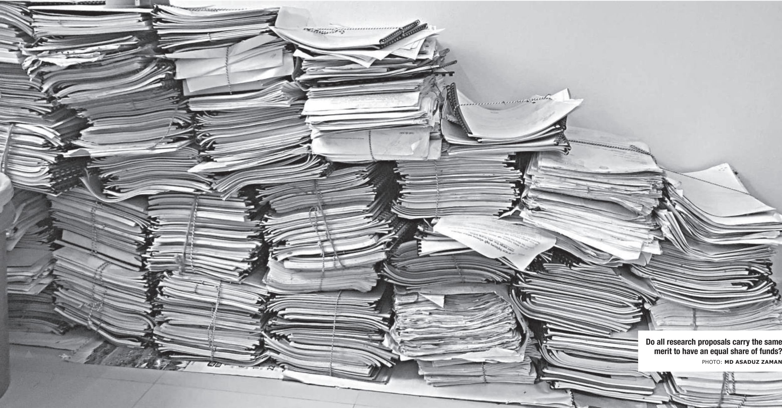
Do all research proposals carry the same merit to have an equal share of funds?