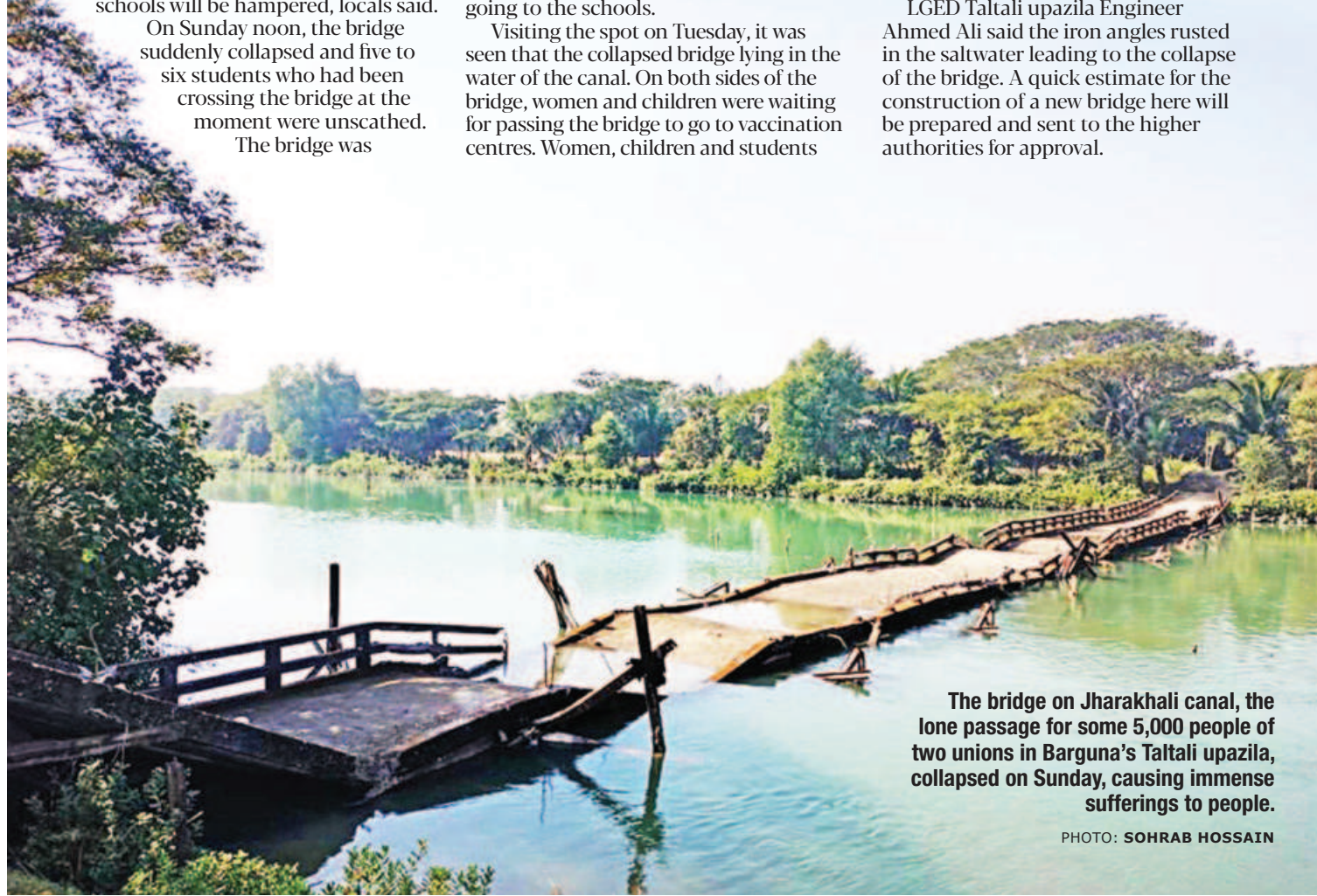
The bridge on Jharakhali canal, the lone passage for some 5,000 people of two unions in Barguna’s Taltali upazila, collapsed on Sunday, causing immense sufferings to people.